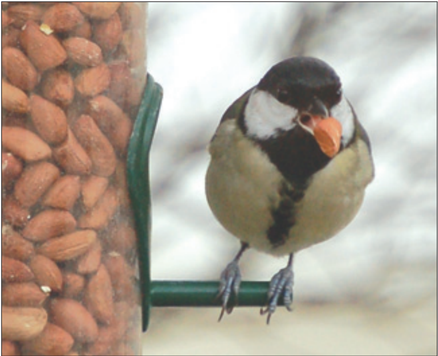
Figure 1. Great tit ( Parus major ) on a peanut feeder.

avian fecundity and resource allocation during reproduction. During the breeding season, time is constrained, and even small shifts toward earlier laying usually bring benefits. In 34 of 59 studies in which laying dates were noted, feeding produced significantly earlier laying dates (Table 2). Such advances were generally less than one week, but, in some cases, were as long as one month. In most instances, earlier broods survive better than late ones (Barba et al. 1995), and extra food has the greatest impact when times are tough (eg in cold years [Svensson and Nilsson 1995], on low-quality territories, and in younger birds [Desrochers 1992]). The type of supplement provided also influences timing. For example, in one study, Florida scrub jays ( Aphe-locoma caerulescens ) given a high-fat, high-protein diet were first to lay, while those on high-fat, low-protein supplements came second, and control groups were unaffected (Reynolds et al. 2003). However, the same species also demonstrates the potential costs of an artificially influenced egg-laying time that becomes mismatched with natural food supply. Scrub jays breeding in suburban