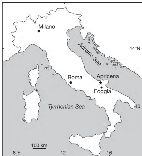
FIG. 1. — Location map of the Apricena quarries area, Italy.

Following the work of some authors (Reig 1956, 1957; Bjork 1970; Ray et al. 1981; Martin 1989; Baskin 2011) the Galictinae subfamily includes some extinct genera, i.e. Enhydrictis Forsyth Major, 1902, Pannonictis Kormos, 1931 from the Old World, Lutravus Furlong 1932, Cernictis Hall, 1935, Trigonictis Hibbard, 1941, Stipanicia Reig, 1956, and Sminthosinis Bjork, 1970 from the New World