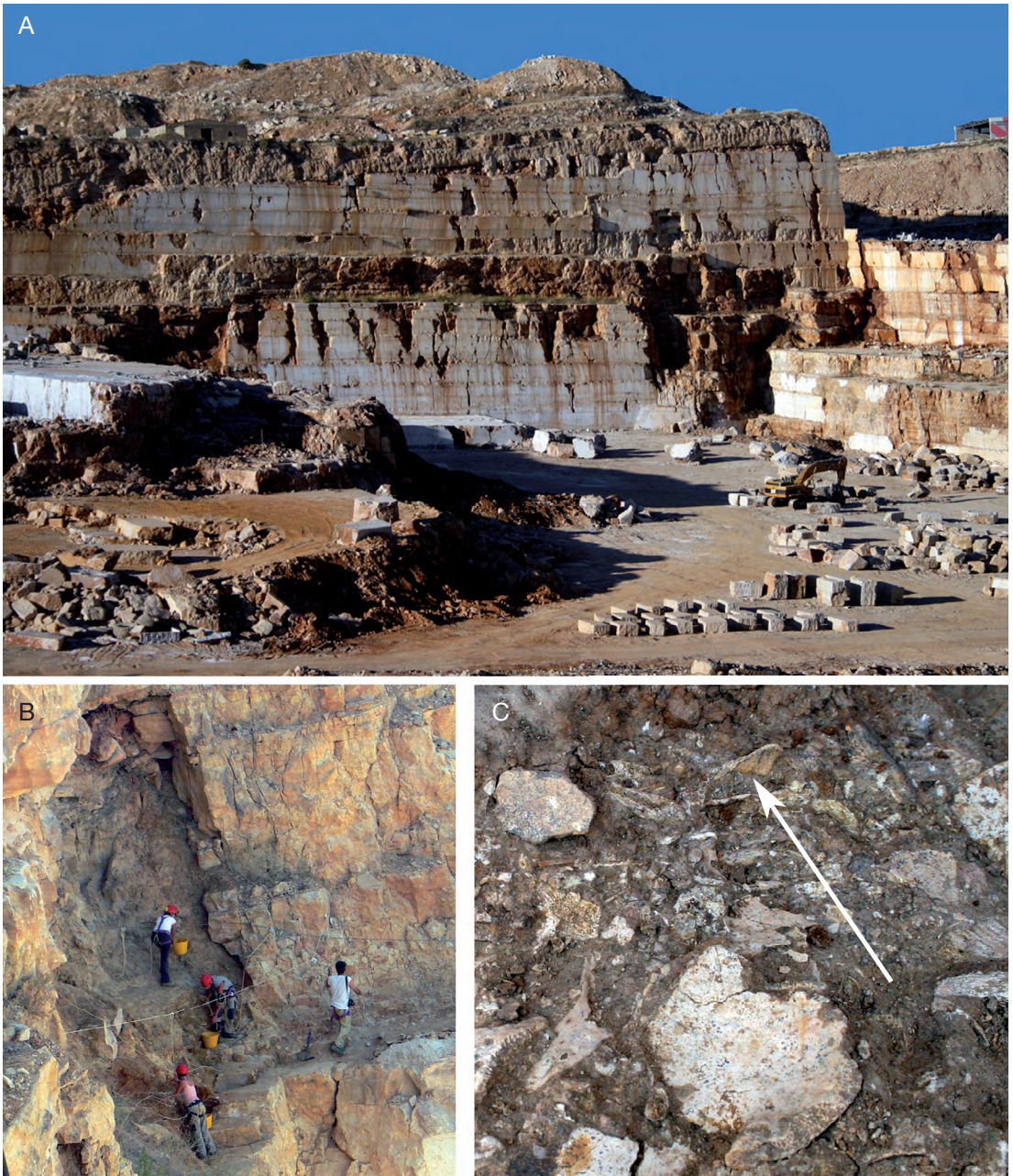
FIG. 2. — View of the Dell'Erba quarry (A) and details on the Pirro 10 fissure (B) during the excavation campaign of 2007; the hemimandible of Pannonictis nestii (Martelli, 1906) still in the sediment before removing (C, white arrow).

closed between the incisures of os palatinum and the pterygopalatine crests in Enhydrictis galictoides cranium is visibly narrower than in the crania of