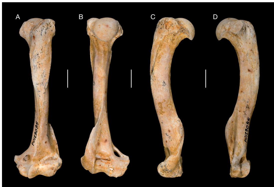
FIG. 4. — Pannonictis nestii (Martelli, 1906) from Pirro 10, left humerus (PU 129095) in anterior (A), posterior (B), lateral (C) and medial (D) views. Scale bars: 10 mm.

margin that encloses the basin of the molar. The talonid is inclined towards the lingual side.