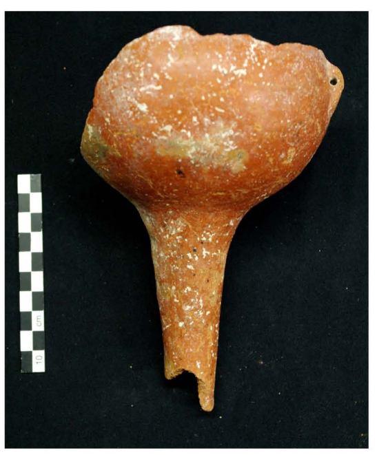
Figure 16: Lophou-Kolaouzou. RP funnel from Tomb 20 (T20/1).