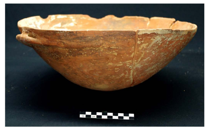
Figure 11: Lophou-Koulauzou. RP basin from Tomb 15 (T15/4).