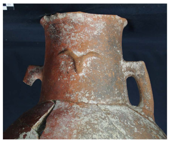
Figure 13: Lophou-Koulauzou. RP amphora with applied horned animal's head on mid-neck from Tomb 20 (T20/7).