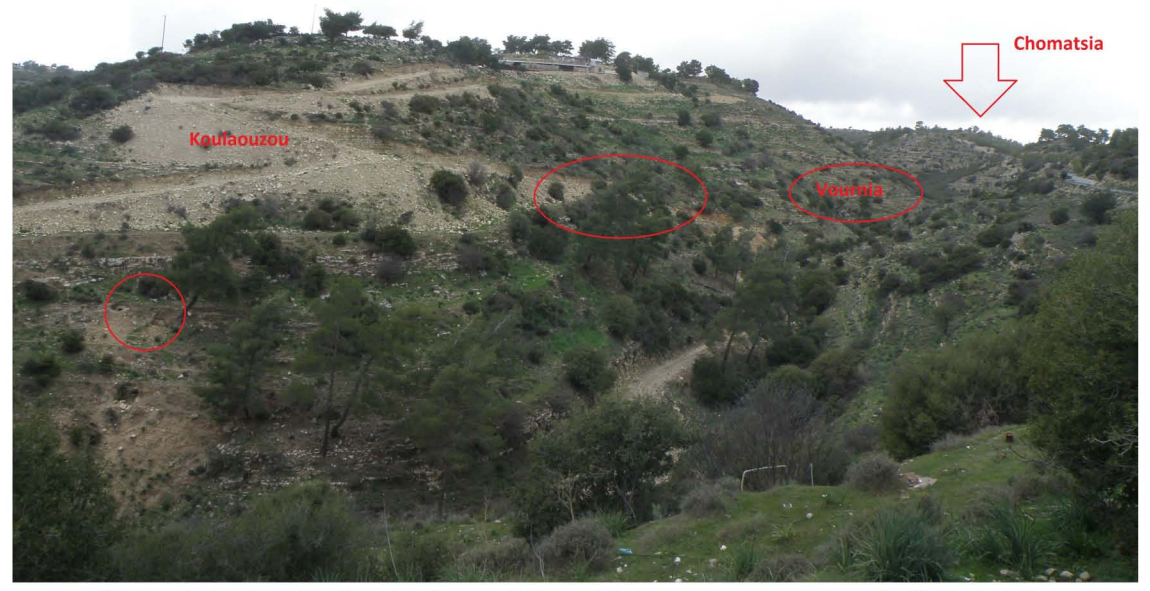
Figure 2: Lophou-Koulauzou. General view of the cemetery area.