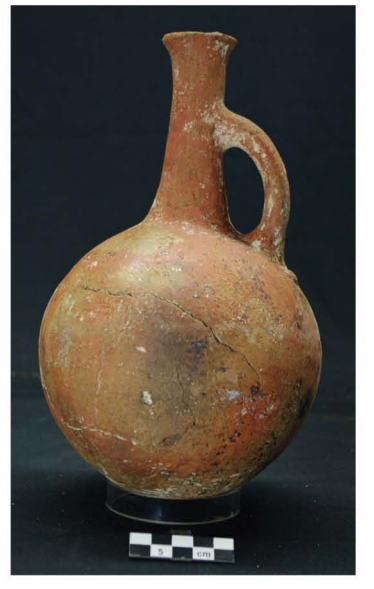
Figure 12: Lophou-Koulauzou. RP globular jug from Tomb 15 (T15/1).