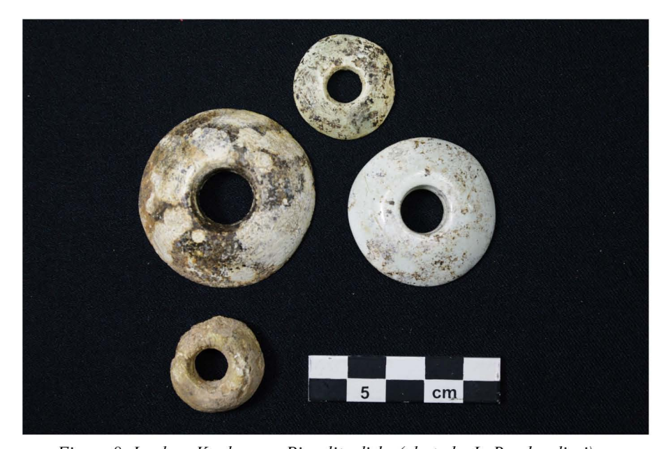
Figure 8: Lophou-Koulauzou. Picrolite disks.