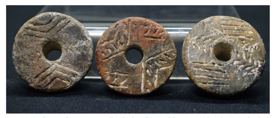
Figure 7: Lophou-Koulauzou. RP spindle-whorls with incised decoration.