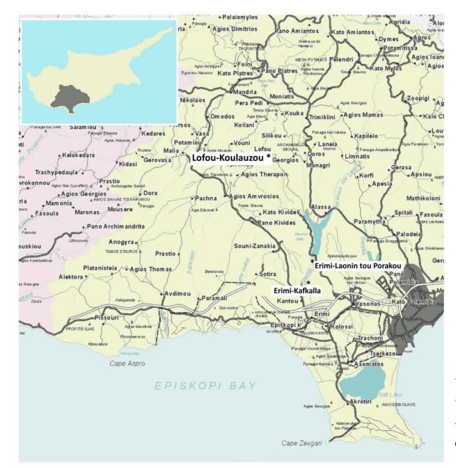
Figure 1: Map of Limassol region with the location of the Bronze Age cemeteries of Lofou-Koulauzou, Erimi-Laonin tou Porakou and Erimi-Kafkalla and Pitharka.