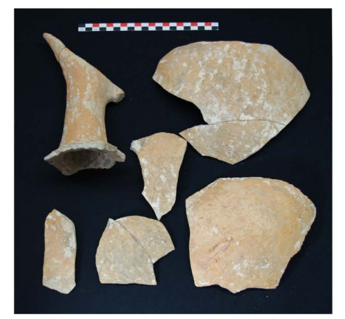
Figure 10: Lophou-Koulauzou. DP handled jug with cutaway mouth from Tomb 8 (T8/3).