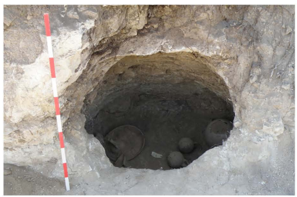
Figure 3: Lophou-Koulauzou. Tomb 15.