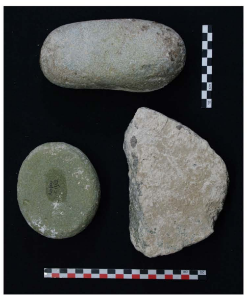
Figure 9: Lophou-Koulauzou. Ground stone tools from burial contexts.