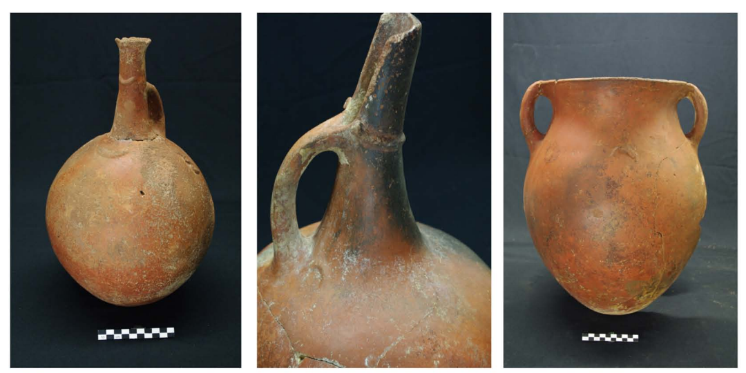
Figure 6: Lophou-Koulauzou. RP vessels with applied "lunettes".