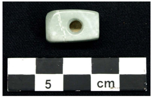
Figure 15: Lophou-Kolaouzou. Picrolite bead from Tomb 17 (T17/1).