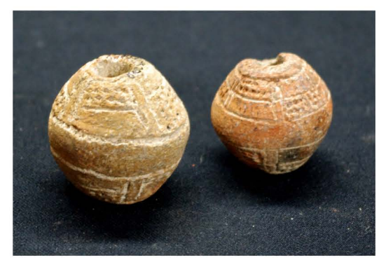
Figure 14: Lophou-Kolaouzou. Spindle-whorls with incised decoration from Tomb 20 (T20/8, 9).