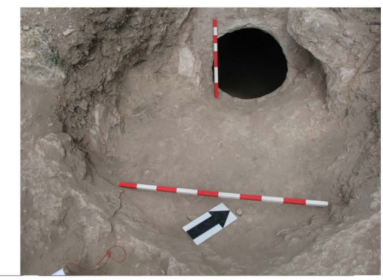
Figure 4: Lophou-Koulauzou. Tomb 20.