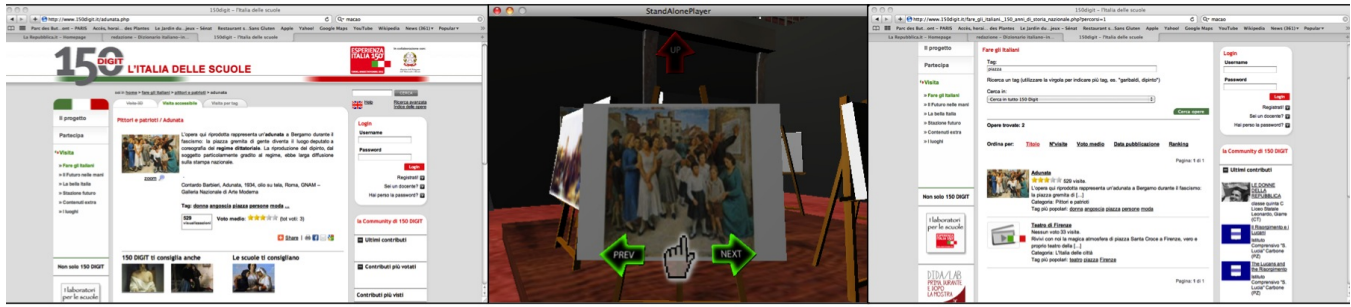
Figure 1: The visit modalities in 150 Digit. Left, standard hypertext; center, 3D visit; right, tag-based visit.

Different types evaluations were carried out by the project team at different stages of development. In the system design stage, and in particular during the requirement elicitation, a focus group of 5 users, 4 males and 1 females, aged 40-62, was selected. The participants were shown to a set of 15 scenario based static interfaces and the main systems functionalities, labeling and layout with the designers, for 3 hours. In general this group of teachers highlighted the need for textual content to be associated to the exhibits, and for dedicated tools for content creation. They appreciated the proposed interfaces/functionalities, and considered them as valid tools for classroom work and students' involvement. The main findings emerged from the focus group affected the project with changes in both labeling (e.g., "favourites" instead of "playlist") and functionalities. In particular, some of the existing functionalities were modified (for example, teachers suggested to show tag recommendations only on request), and new ones were added: mainly, the possibility of creating a virtual class where students can discuss the exhibits and insert comments that are visible only within this class.