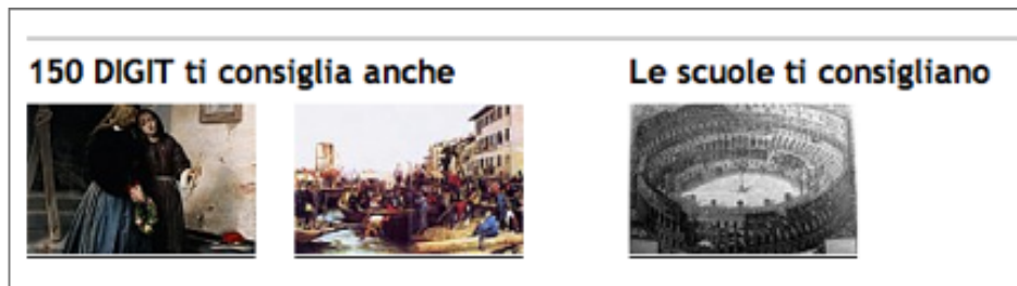
Figure 4: Content recommendation in 150 Digit. On the left, the tag-based recommendations (“The systems recommends you”); on the right, the preference-based recommendations (“Schools recommend you”).