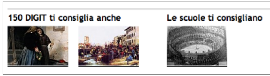
Figure 4: Content recommendation in 150 Digit. On the left, the tag-based recommendations (“The systems recommends you”); on the right, the preference-based recommendations (“Schools recommend you”).