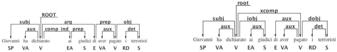
(a) MIDT representation