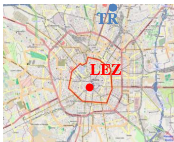
Figure 1. PM sampling at the traffic site (TR) and the limited traffic site (LEZ) in Milan.

PM (total suspended particles) was sampled in the urban area of Milan at two sites: a traffic site (TR, within the Campus of the University of Milano Bicocca) and a limited traffic site (within "Area C" low emission zone, LEZ). The sampling campaign was performed simultaneously at the two sites in October 2013 (1-15 October) during working days, from 8.00 a.m.-18.00 p.m., when traffic limitation inside the LEZ was implemented.