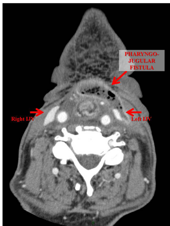
Fig. 1 Neck computed tomography (axial view) showed the presence of a fistula between the left internal jugular vein and pharynx