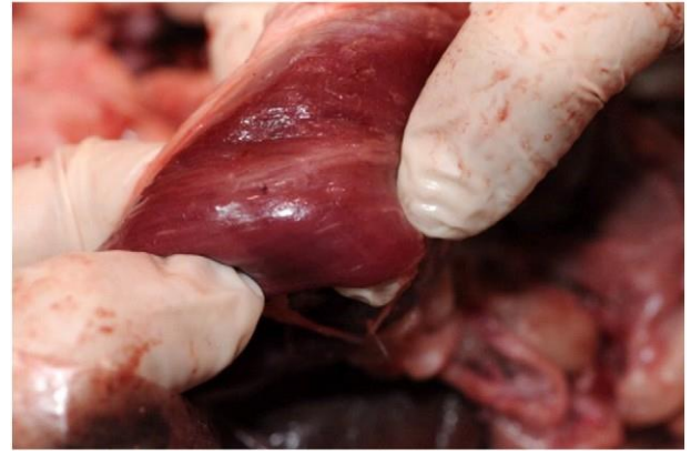
Fig. 2. Slender fusiform (SF) sarcocysts localized in skeletal muscles.