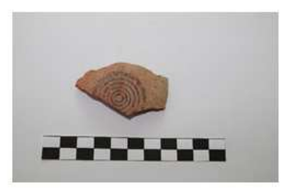
Fig. 3 – A Cypriot Iron Age sherd before and after the restoration