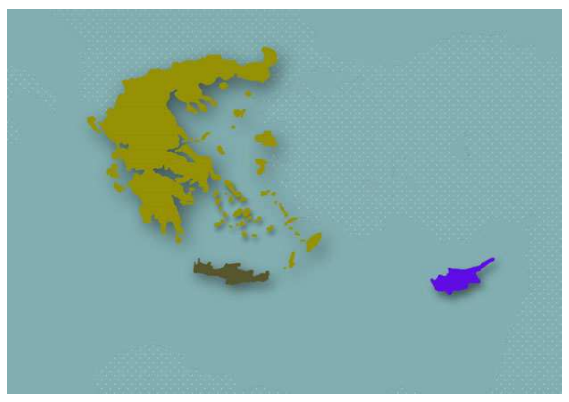
Fig. 1 – The three macro-regions: Greece, Crete and Cyprus.

As to the regional provenance, the majority of catalogued material comes from Crete (40%) and Greece Mainland (38%), while 22% of recorded ceramics and small objects are from Cyprus.