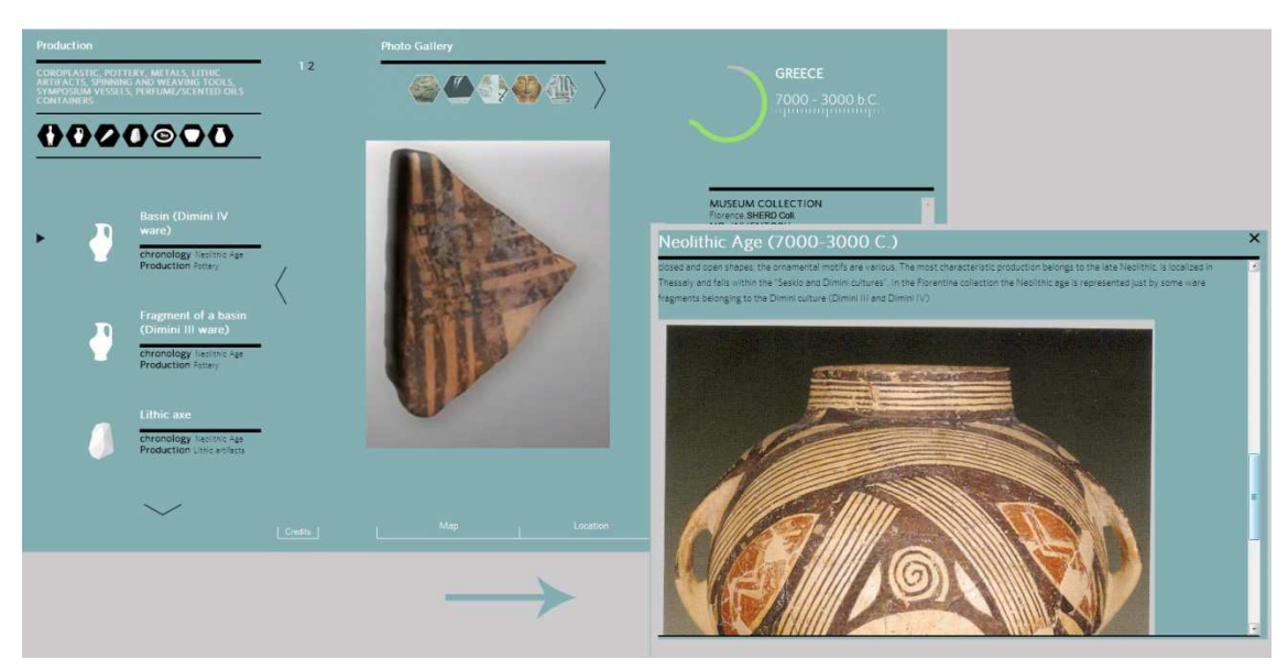
Fig. 4 – Neolithic sherd from Dimini (Thessaly).