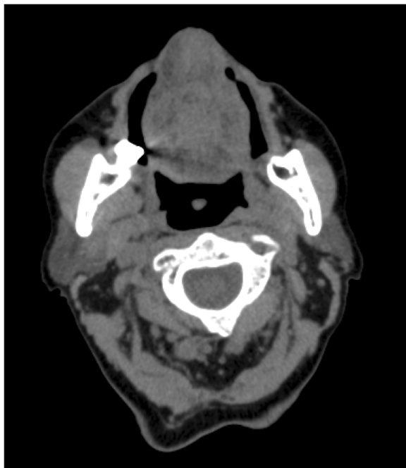
Fig. 2 CT scan after 6 months of chemotherapy showing the complete disappearance of the tumor mass primarily located in the body of the tongue

disease. From September 2013 to March 2014 the patient received 12 cycles of FOLFOX regimen. Treatment was generally well tolerated with improvement of patient quality of life, reduction of dysphagia and recovery of a normal eating. Body weight increased and local pain control was satisfactory. The CT scan performed in April 2014, at the end of the chemotherapy program (Fig. 2), showed the complete response of the primary lesion, together with the partial response of the lymphadenopathies and lung metastases. Liver metastases presented conflicting findings