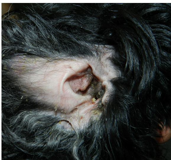
Fig. 2. Scaling dermatitis with very mild erythema of the inner aspect of the pinna in the same dog as in picture 1. Ceruminous otitis was also present.

The worsening of an unidentified predisposing condition, a concomitant immunosuppressive disease, or the presence of azole resistance were considered as possible causes for the loss of treatment efficacy. Concomitant systemic or dermatological problems were not