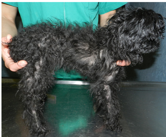
Fig. 1. Severe generalized scaling dermatitis due to M. pachydermatis in a 5-year-old neutered female toy Poodle. A large amount of scales has been shed on the surface of the consulting table.

in the skin and ear cytological samples. Treatment frequency was increased, as follows: itraconazole oral solution 5 mg/kg once daily; 2% chlorhexidine and 2% miconazole shampoo every 2 days. However, there was neither improvement in dermatological signs, nor a reduction in the number of yeast cells in skin and ear cytological samples.