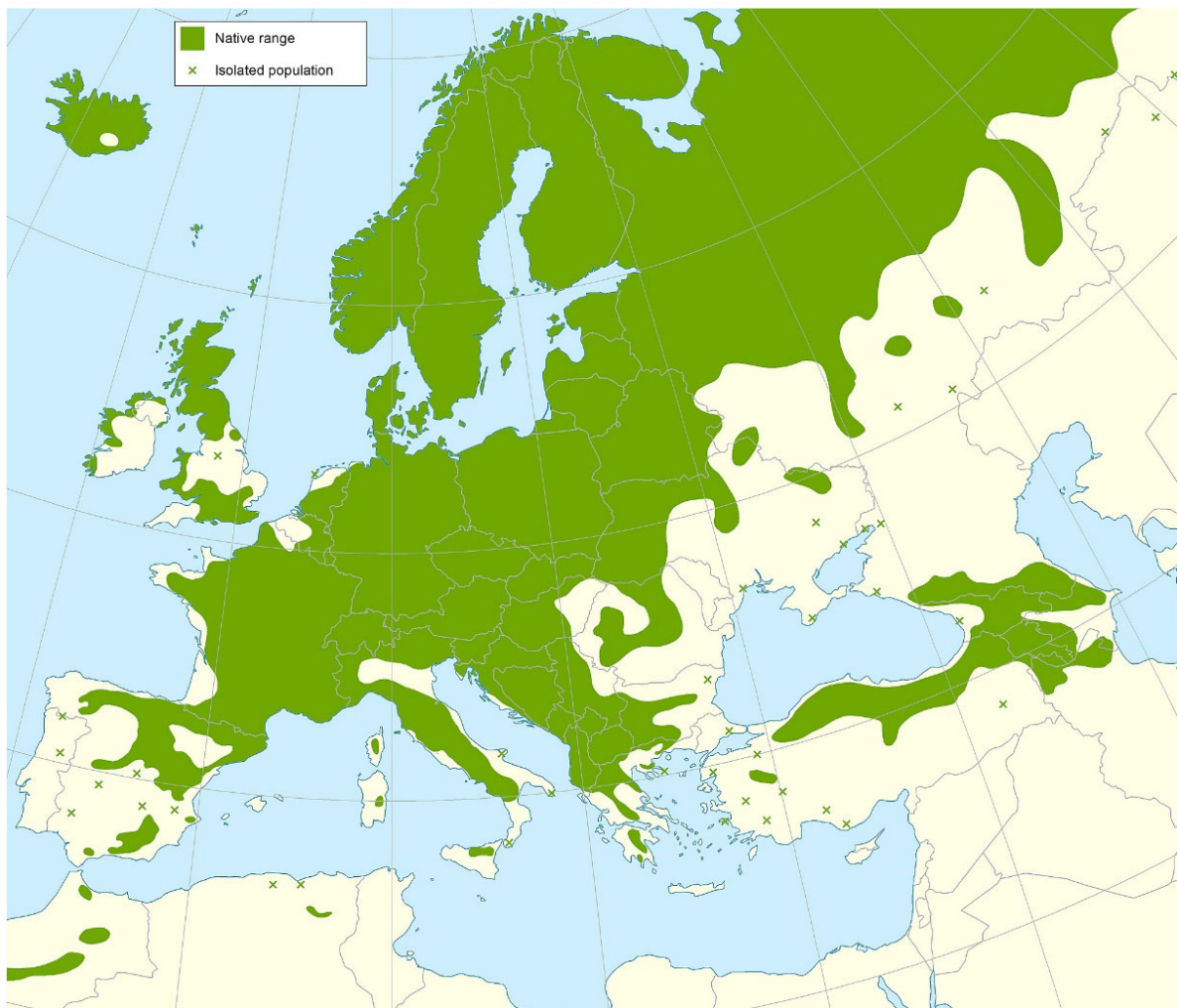
Figure 2: Distribution map of Juniperus communis , from Caudullo et al. (2017)

The main telial and aecial host species of Gymnosporangium spp. (non-EU) (see Section 3.4.1) are common as native and/or cultivated plants, including ornamentals, in the EU. The most common telial native species J. communis is widespread throughout the EU, with the exception of the most south-western and southern areas (Figure 2).