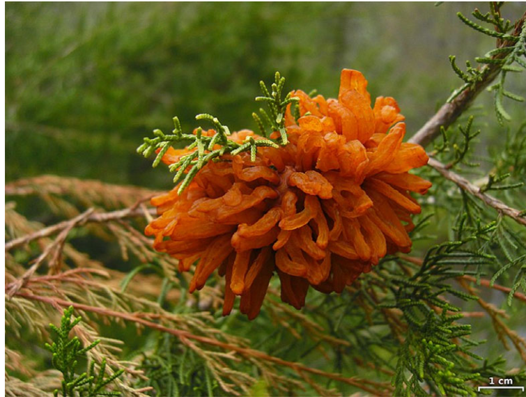
Figure 3: Gymnosporangium juniperi-virginianae , Smoky Mountains, North Carolina, US. Photo by Jason Hollinger. Available online: https://commons.wikimedia.org/wiki/File:Gymnosporangium_juniperi-virginianae_-_Flickr_-_pellaea.jpg