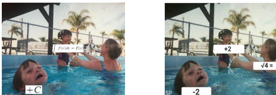
Figure 3: Drowning kid in the pool correct (left) and wrong (right) memes

To focus more on the concept of mathematical Internet memes and illustrate their epistemic potentiality, we shall analyse two examples of the Drowning kid in the pool meme (Figure 3), used to describe a situation where something is typically forgotten. On the left a correct version posted in May 2018 within a Reddit thread , where was identified as “the quintessential math joke”, on the right its wrong variation, posted in another Reddit thread in June 2018.