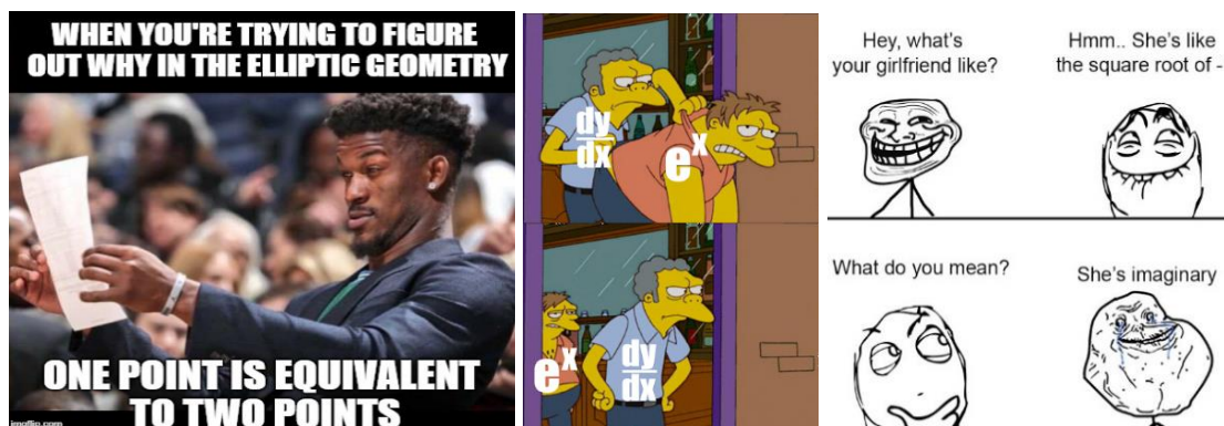
Figure 5: Example 1 (left), Example 2 (centre), Example 3 (right)

Reveal app to a smartphone, following lifeonmath and then scanning the images in Figure 5 – due to monitor light reflections, it works better with printed images).