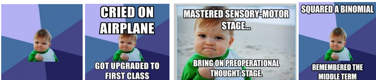
Figure 2: Template and propagation of the Success Kid meme

Pictorial parts, usually identified with names, might have local or global recognisability: in Figure 2, a blank template of the Success Kid meme - globally used to boast of something good - is shown, followed by a general example of the meme propagation by imitation and an example of its psycho-pedagogical adaptation, to end with its mathematical variation.