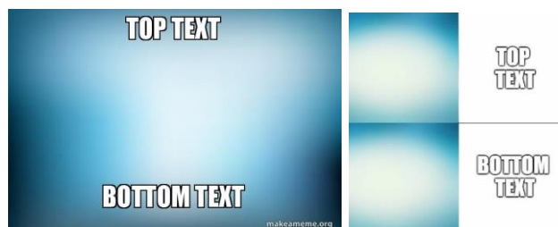
Figure 1: Two prototypical meme structures

They are deeply rooted in visual media culture and catch users’ attention with their puzzling vibe that calls for the active contribution of the viewer to unlock the meaning and thus adds a gratifying flavour. Internet memes are created by users according to collectively established and shared rules that govern the so-called memesphere : these rules dictate the conventional meaning of the pictorial parts and the position, font, syntax and narrative structure of the text, they “cannot be enforced by a specific person, but the community sanctions wrong uses by downvoting, not liking or simply not spreading the misused meme” (Osterroth, 2018, p.7). These same rules shape meme generators websites as https://imgflip.com/mememplates or https://makeameme.org/ : there are several accepted structures, two of the most common being those in Figure 1.