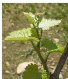
Fig. 1. V. vinifera green pruning residues

Results show that, even though leaves and GPR can be discriminated using statistical tools, the qualitative and quantitative results of the two by-products are comparable. Since GPR, are the most widely available residues, they may be further investigated in order to evaluate an effective potential antioxidant activity..