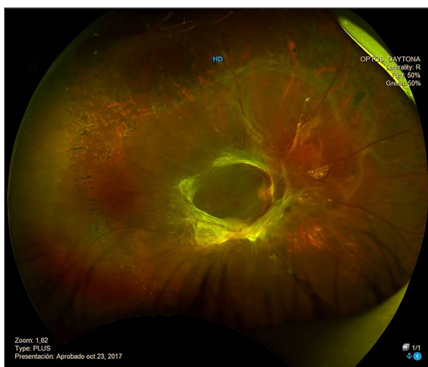
Fig. 1 Example of a UWF fundus image showing significant fibrosis due to proliferative diabetic retinopathy

Smartphone-based imaging tools may be useful for DR screening programs in which cost and availability of trained eye care personnel are barriers to implementation [24, 25]. However, no handheld device has been found to have comparable sensitivity and specificity to seven-field stereoscopic photography in detection of STDR. Rajalakshmi et al. [26] compared the “fundus on phone” (FOP) smartphone-based retinal camera with seven-field digital retinal photography and noted that the modalities yielded the same results for 92.7% of patients ( \kappa , 0.90). These authors suggested that the FOP camera was effective for screening and diagnosis of DR and STDR [26]. However, they noted that all patients underwent mydriasis in this study and that the image quality of the reference standard was superior to that of the FOP system. In this study, the smartphone was fixed and the patient’s head was secured by using a slit-lamp chin rest. This simple variation may significantly improve results