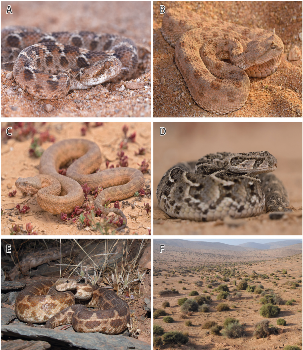
Figure 2. (A,B) Photographs of Echis leucogaster (A) and Cerastes cerastes (B) from Aouinet Lahna. (C,D) Daboia mauritanica (C) and Bitis arietans (D) found north of Oued Chbika. The Daboia specimen belongs to the pale morph according to Bons and Geniez (1996). (E) The Daboia mauritanica with a contrasted pattern found on the Plage Blanche road West of Guelmin. (F) The habitat near Plage Blanche where both Daboia and Bitis have been observed.

mauritanica along much of the coastal topoclimatic unit of southwestern Morocco (Fig. 2F).