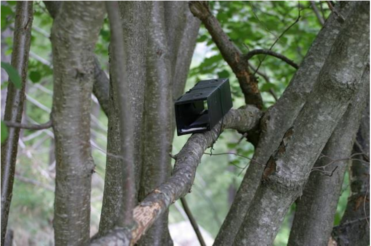
Fig. 1. A footprint tunnel placed on a branch.