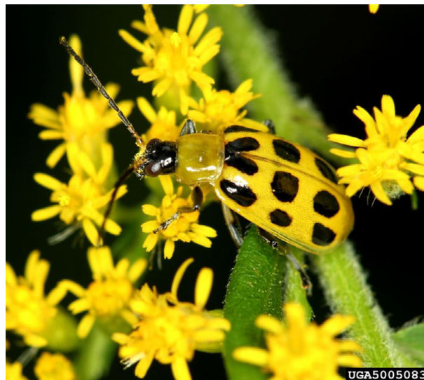
Figure 1: Adult Diabrotica undecimpunctata undecimpunctata .

Pupae: Pupae are exarate adecticous, whitish and 6 mm long. They are found in earthen cells in soil near plant roots (Alston and Worwood, 2012; Arant, 1929).