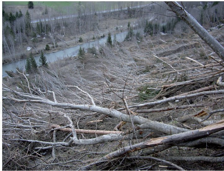
Figure 4. Destruction of a young deciduous forest by an avalanche. Photo: K. Suntinger, 2009.