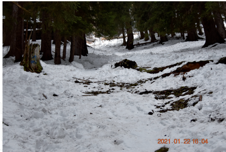
Figure 2. Release of a snow avalanche in a spruce forest triggered by air temperature rise from -12 to 6^{\circ}\text{C} within few hours. The 208 m long avalanche with a vertical drop of 147 m buried a local road.

The literature on protective stem densities is based on different analytical approaches and they vary considerably. They refer to different caliper thresholds and mean diameters of the stems at breast height (DBH). Thresholds of protective stem densities are usually related to slope inclination. Approaches based on mechanical calculations show stem densities needed to stabilize the snowpack, for example with an average DBH of 5 cm, from about 2,000 on gentle slopes to more than 10,000 stems per hectare on steep slopes [34, 36]. These calculations are very sensitive to slope, DBH and snow conditions. Observations and statistical approaches [14, 16, 26] usually do not confirm them. Figure 3 shows stem densities recommended by the European guidelines to stabilize snowpack versus a sample of 142 observed snow avalanche initiations in forests mainly provided by a Swiss database [14]. Based on this sample, the miss rates (FNR) of the guidelines are low, not exceeding 15%. However, most of the guidelines tend to propose quite higher stem densities than observed and underestimate the effects of the trees [7]. Snow avalanche initiations in forests with stem densities of more than 900 per hectares (DBH >6 cm) seem to be statistical outliers allocated to deciduous broadleaved and mixed forests on very steep slopes [7].