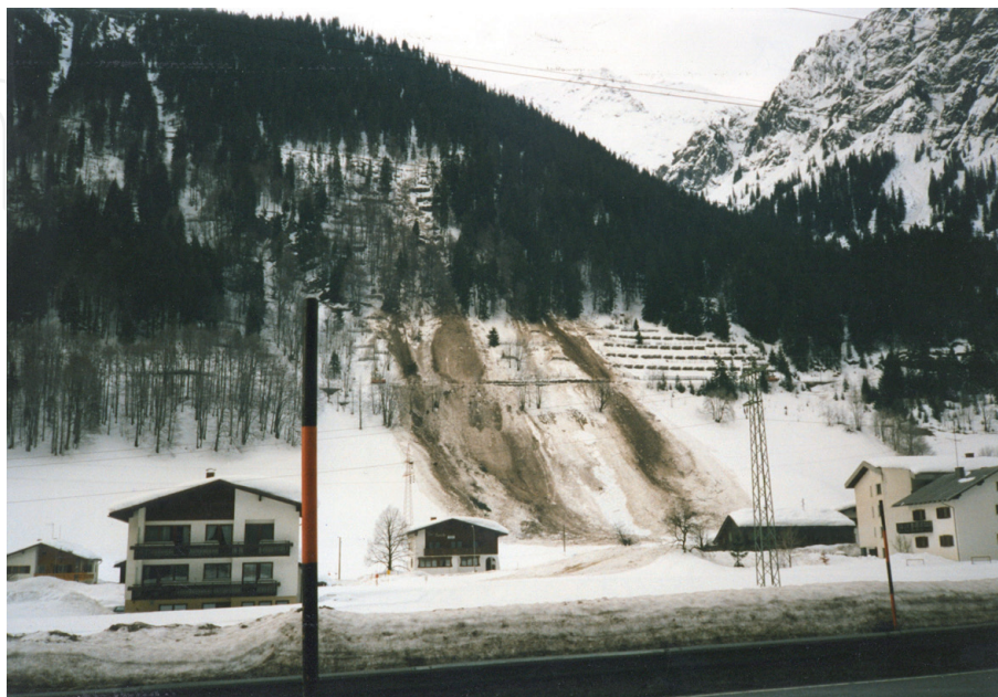
Figure 1. Muddy snow avalanches from forest triggered in march 1988 by rain after 38 cm snowfall within 3 days. Photo: K. Perzl, 1988.

Most avalanches that are perceived in Alpine settlement areas as coming from forested terrain originate from slopes or canyon heads above the current timberline or from currently open areas [15]. Nevertheless, forests on steep mountain slopes should never be considered as areas not prone to avalanche formation [16]. The basic avalanche release susceptibility of forested slopes in the Alps is not evident in hazard and damage statistics, as it is masked by the protective effect of the mainly dense woody vegetation and by artificial snow supporting structures which already have been established at the beginning of the 20th century in forests with high protective functions and low protective effects [7].