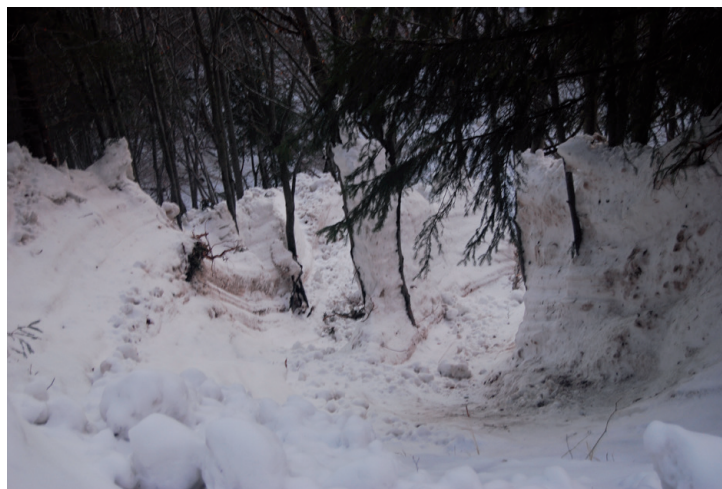
Figure 5. Detrainment of avalanche snow by trees.

surface roughness on short-slopes and to promoting stand stability by species selection, formation of resistant individuals and acceptance of shrub-dominated growth.