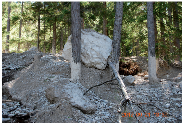
Figure 7. Detrainment of coarse debris from a debris flow by forest at the alluvial fan. Photo: F. Perzl, 2012.

Trees and coarse woody debris can retain mobilized sediments and therefore reduce hillslope and torrential debris flows [75–79]. Large-scale datasets indicate lower frequencies [80] and runout lengths [81] of debris flows and debris avalanches in mature forests in relation to other land uses or clear-cuts and young forest. However, the reduction of runout lengths may be an effect of smaller landslide densities and erosion volumes in mature forests rather than a barrier effect [76]. Results of [78] indicate a higher potential of trees and logs to retain debris at low-order section of rivers than on alluvial fans. Detrainment of debris on alluvial fans by forest depends on sediment concentration and tree density [82]. Trees increase the flow resistance and favor the deposition of materials due to detrainment of (coarse) debris, but the protective effect is difficult to assess ( Figure 7 ).