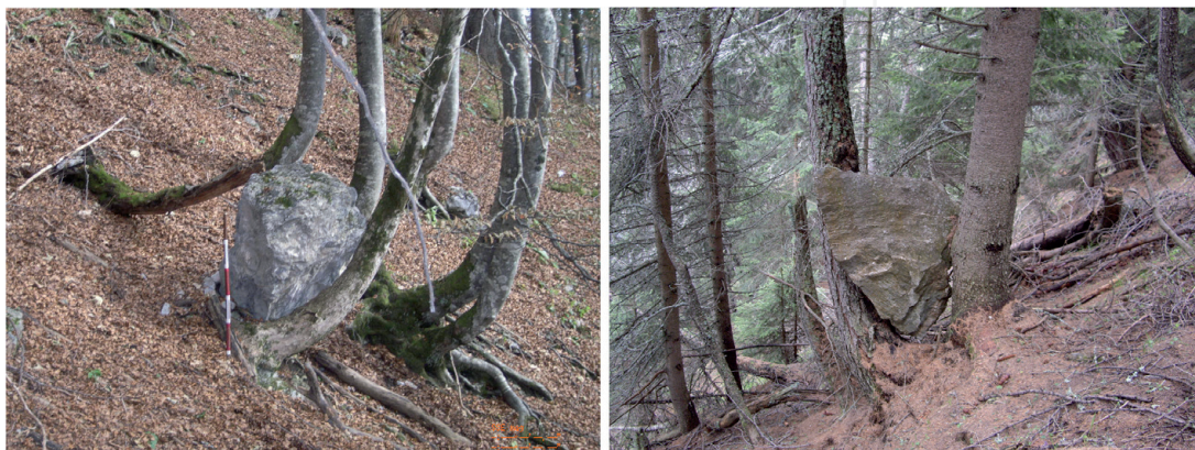
Figure 8. Left – Small beech and sycamore trees stopped a boulder of about 1.5 to 2 m 3, right – a wedge-shaped boulder caught by a larch and a spruce tree.

At the slope-scale, the protective effect of forest depends on the rock size, shape and energy, the terrain morphology and surface conditions like roughness and the damping potential of the soil, and the length of the forested slope as well as the density of the forest cover. The protective density of the forest is indicated by the (average) stem density or basal area ( Table 3 ). Both approaches require the definition of the protective stem diameter. The usability of both approaches for risk assessments is limited by two facts: 1) forest density may vary considerably on a small spatial scale and stem distributions may change from random to clumped and 2) the length of the forested slope influences the protective density. Furthermore, concepts which are based on block diameters neglect that the block diameters of mobilizable rocks are