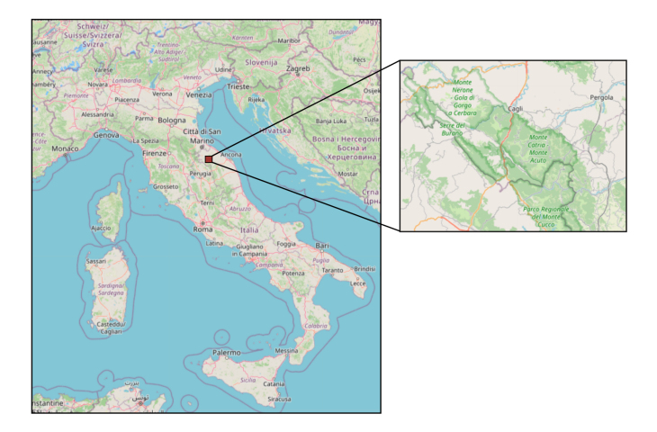
Fig. 1. Mount Catria and neighbouring areas of the Central Apennines in which the developed welfare measurement protocol was applied.

The welfare assessment was carried out on extensive farms with horses kept on 26 different pastures and on 7 confined farms of Mount Catria and neighbouring areas of the Central Apennines (Figure 1). In the confined farms horses were kept in barns with two open sides and free access to outdoor dry lot paddock. A total of 33 surveys were conducted by a trained veterinarian expert on welfare protocols between June 2021 to September 2022.