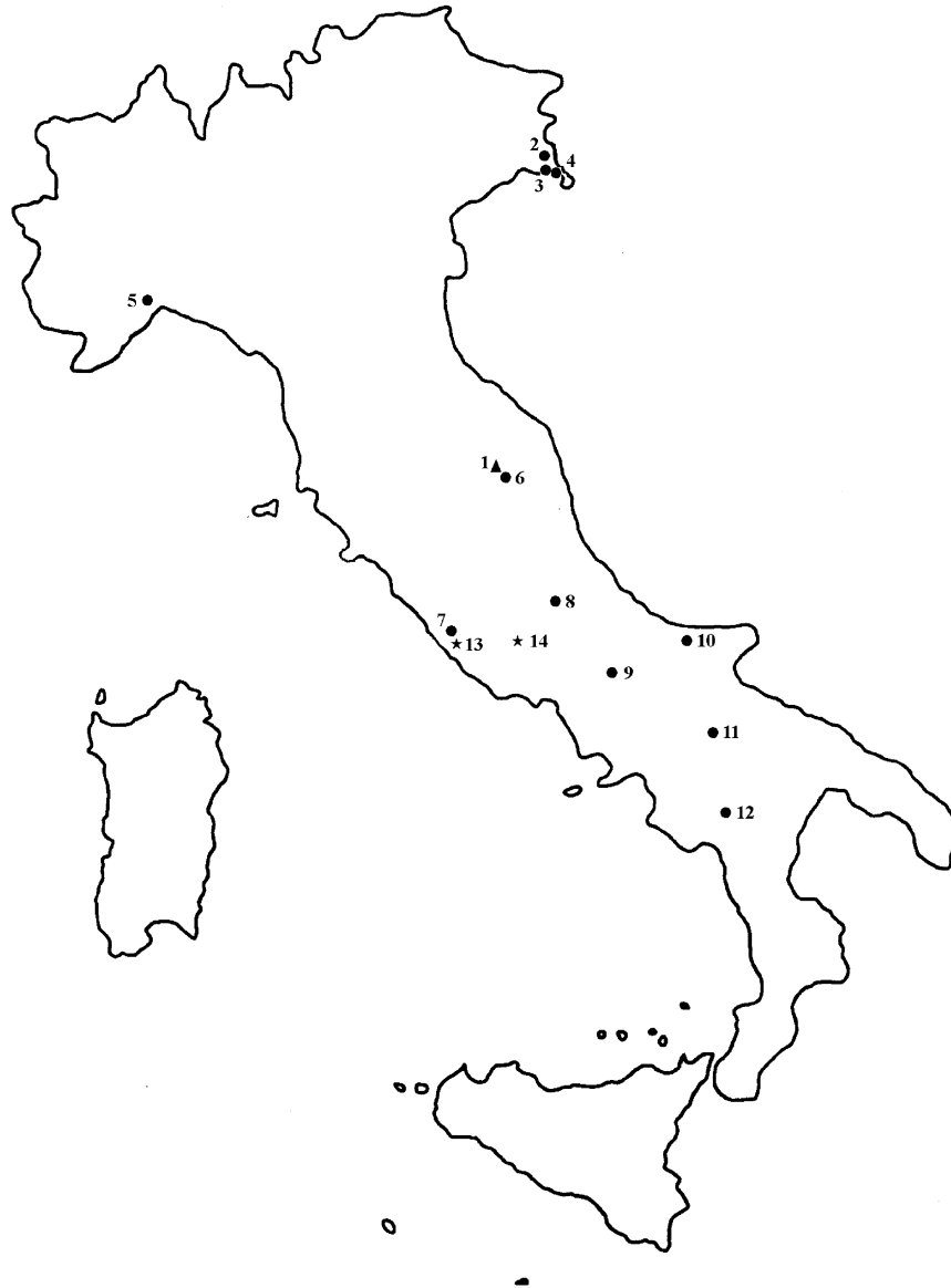
Fig. 1. Map of Italy with the position of the localities cited in the text: 1, Colle Curti; 2, Slivia; 3, Visogliano; 4, Valdemino; 5, Cesi; 6, Ponte Galeria; 7, Pagliare di Sassa; 8, Isernia La Pineta; 9, Tre Fossi; 10, Venosa-Notarchirico; 11, Mercure River basin; 12, Bristie; 13, Fontana Ranuccio.

lycaonoides (Martínez-Navarro and Rook, 2003), Pachycrocuta brevirostris , Homotherium latidens , Mammuthus meridionalis , a small rhino ( Stephanorhinus sp.), Pliomys lenki and Microtus (Allophaiomys) sp. also occurred. Accordingly, in the Colle Curti LFA the faunal renewal characterized the beginning of the Middle Pleistocene was not yet evident (Palombo, 2004). The faunal complex referred to as the Slivia FU is characterized by the first occurrence of Ursus deningeri , Crocota crocuta , Sus scrofa , Cervus elaphus acoronatus , Bison schoetensacki , Stephanorhinus hemitoechus and Elephas antiquus , whereas the appearance of M. trogontherii has to be proven (Palombo and Ferretti, 2004). Some localities in northeastern Italy have also been referred to early Middle Pleistocene of Galerian, nonetheless their biochronological position has to be clarified. Lugli and Sala (2000) revised the fauna from