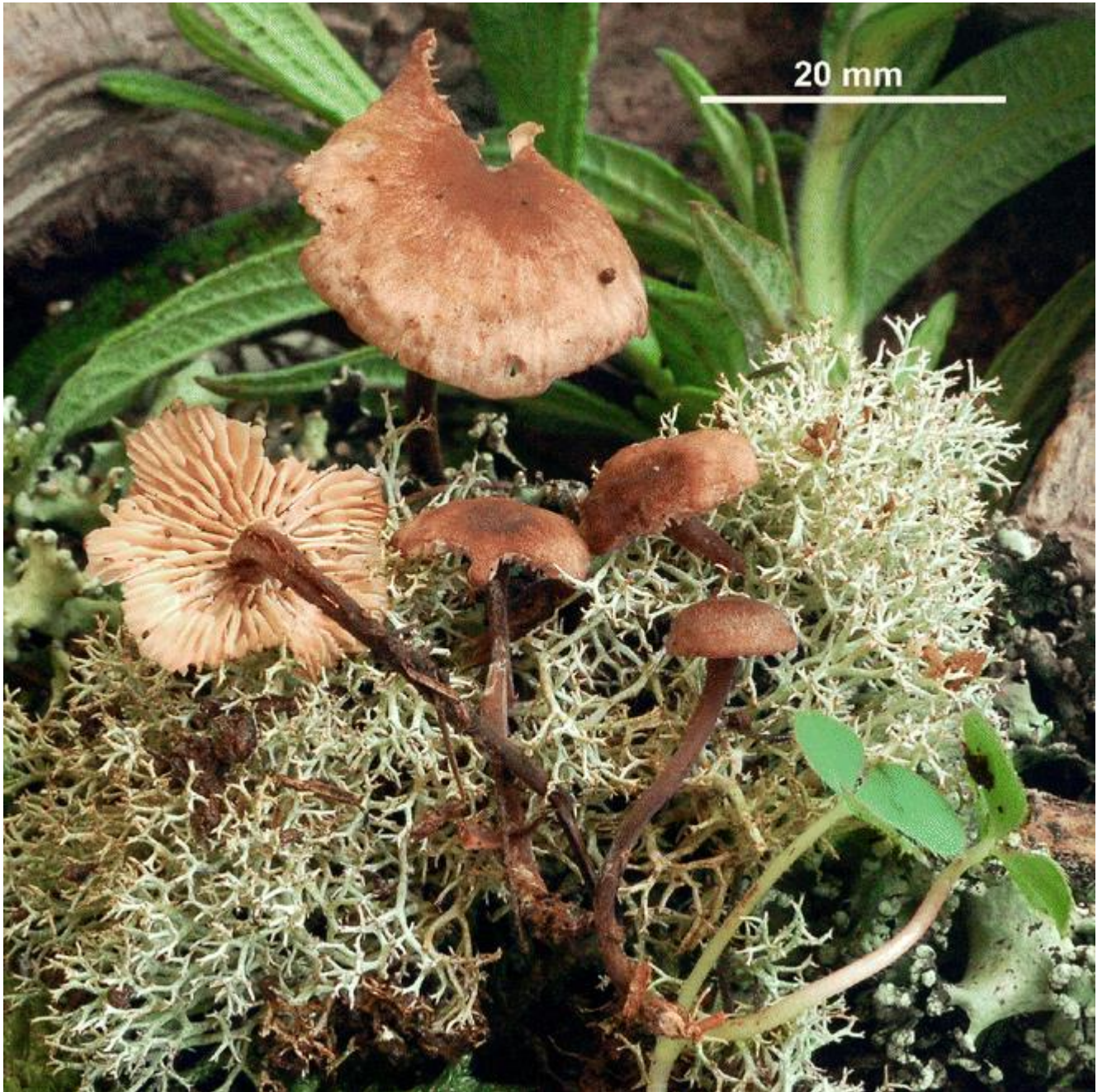
Fig. 1 Basidiomes of Clitopilus canariensis (from the holotype).

Clitopilus canariensis Dähncke, Contu & Vizzini, sp. nov. Type: Spain. Canary Islands, La Palma Island: Lomo del Cuchillo, 800 m, 6 Dec 2008, leg. R. M. Dähncke (holotype: TO AVEC11). Mycobank MB 518949. (Figs. 1, 2A–D)