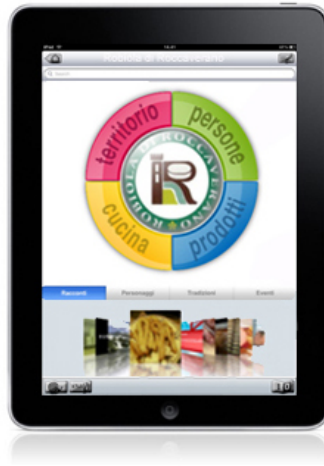
Fig. 3. Dynamic interface in video domain: iPad application

Gusto” in Turin, Italy. More than 600 users were divided into four groups depending on their age and technology usage. They used Apple iPhones to explore the objects of our domain. We wanted to test the intuitiveness of our approach, easiness of usage and usefulness of the information obtained.