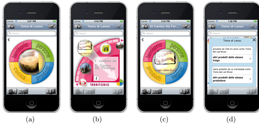
Fig. 2. Dynamic change of the sectors

of the wheel (see Figure 2(b)), the sector configuration changes automatically: cuisine and products are replaced with products and shops (see Figure 2(c)).