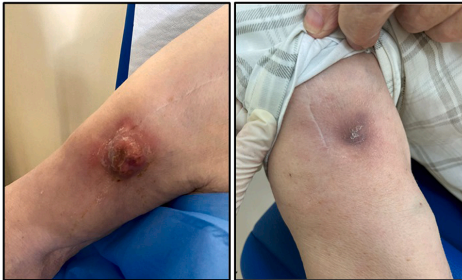
Fig. 2. Clinical improvement after three doses of 1200 mg of oritavancin.

progressive improvement in pain and mobility. After the sixth dose, i.e. 12 weeks after starting the treatment with oritavancin, the pain disappeared, and the patient completely recovered joint mobility. Physical and US-guided examination showed a complete healing of the fistula and the disappearance of the underlying abscess.