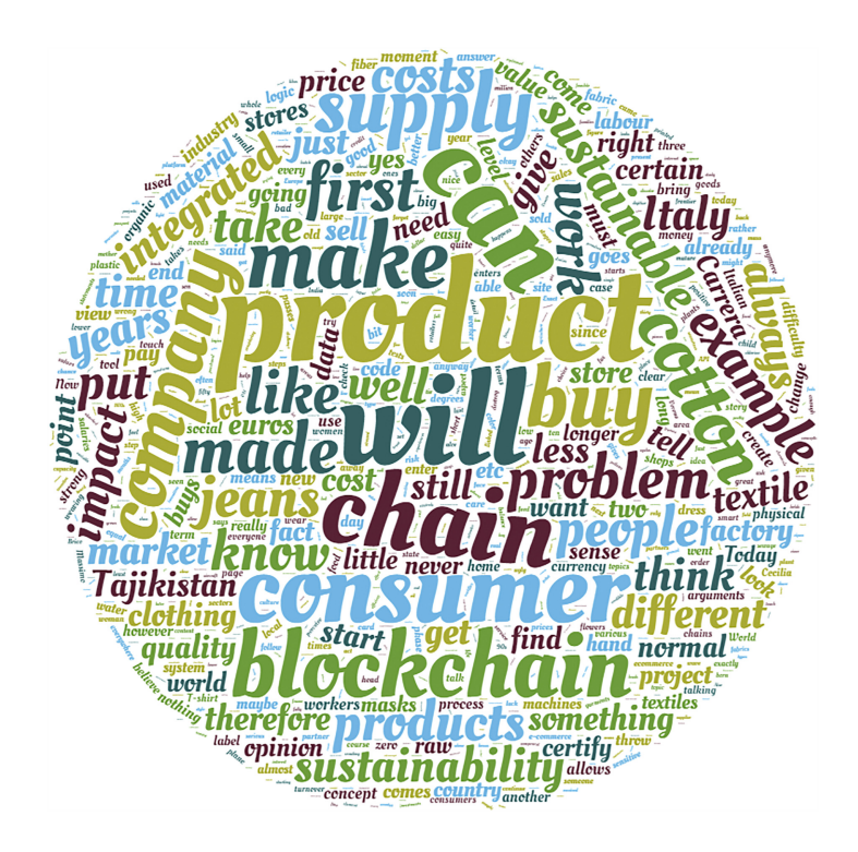
Figure 1. Word cloud

graphically shows the most redundant words extracted from the interview transcripts, while Tables 3 and 4 outlines the coding structure.