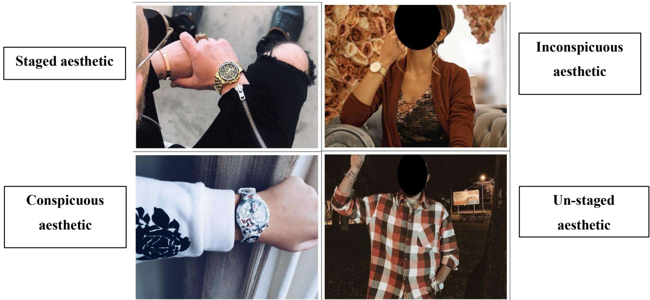
Table 6. Visual content analysis – Main categories and occurrences count (%)