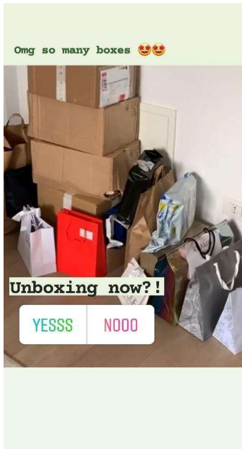
Figure 3. Wasteful consumption, an example (fabricated results)

All these examples point to the dimension of wastefulness by documenting the accumulation of material goods and experiences and the possession of products beyond mere necessity. These elements are expressed thanks to the visual display of such accumulation and through textual and audio content that stress it even further.