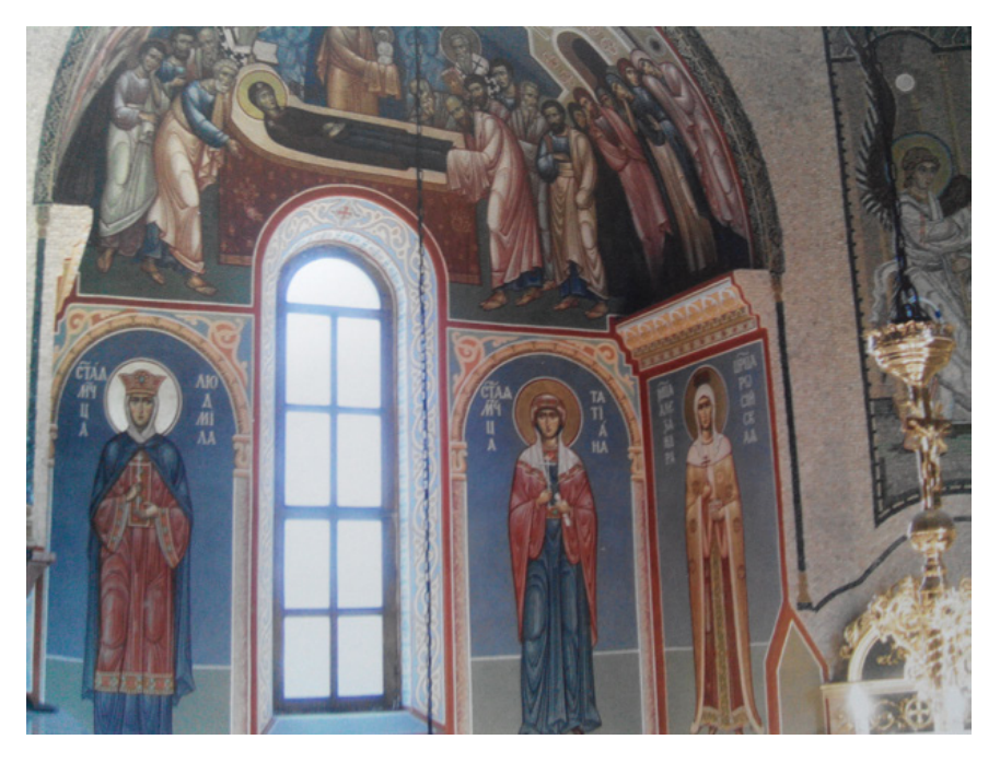
Fig. 3 A part of the painting of the northern wall of the temple: the Assumption of the Most Holy Theotokos, below are images of the holy martyrs: Lyudmila, Tatyana, Empress Alexandra (2006).

In the upper part of the southern wall, opposite the Assumption of the Blessed Virgin Mary – the Nativity of Christ, then – especially revered saints: Saint Blessed Prince Dimitri Prilutsky, Saint Martyr. Patr. Tikhon, Saint Rights. John of Kronstadt. In the medallions opposite the holy royal martyrs-children are images of Saint Martyr. Faith, Hope, Love and their mother Sophia.