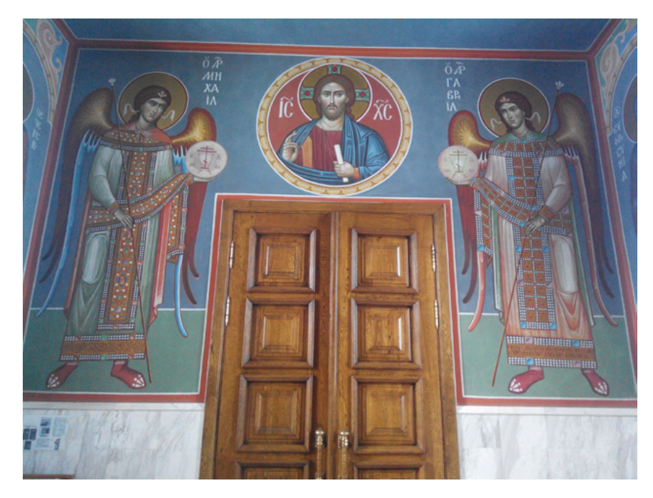
Fig. 4 The western wall of the church: the image of Jesus Christ in a medallion, on both sides of which the archangels Michael and Gabriel are depicted by Alexander Chashkin (2006).

Consequently, when compiling the program for painting this temple, the general canons of building iconographic plots, the dedication of the temple were taken into account (the images of the Most Holy Theotokos are found both in the conch of the apse, and in the under-dome skufya, and on the kliros; the main background of the painting is blue, which is considered the color of the Most Holy Theotokos and symbolizes Her ever-virginity<sup>10</sup>); the purpose of the temple as the main temple of the Lavra skete was taken into account – the images of the saints make up a significant part of the paintings.