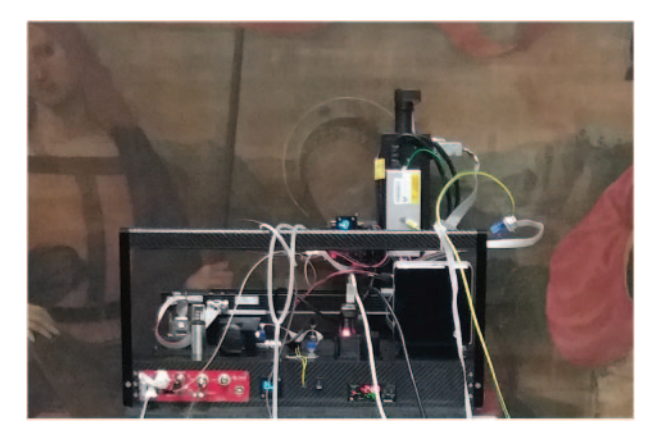
Fig. 1. – INFN-CHNet MA-XRF scanner placed in front of a painting at the CCR "La Venaria Reale".