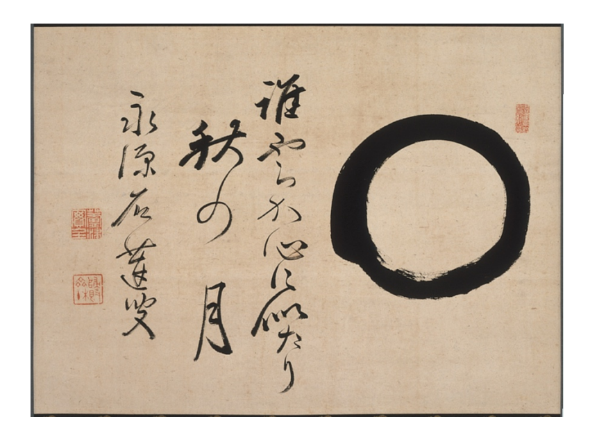
Figure 26. Sekiren Ashizu, Enso. Meiji period. Hanging scroll, ink on paper. Gitter-Yelen Collection (collection ref. 2004.22).