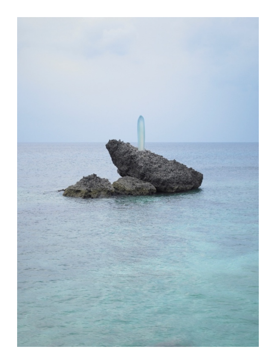
Figure 23. Mariko Mori, Primal Rhythm – Sun Pillar. 2011.

where the circular shape seems almost suspended on top of the 60-metres cascade. Due to its materials, the colors of the circle change constantly, according to the different ways it is illuminated by the sun rays during the day, which make it vary from blue to white and gold.