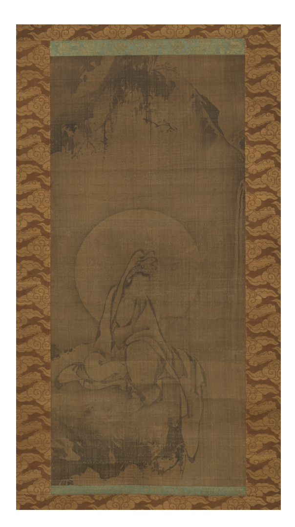
Figure 9. Unknown artist, Triptych of White-robed Kannon, Kanzan, and Jittoku (detail), XIV century. Ink on silk. Mary and Cheney Cowles Collection, Gift of Mary and Cheney Cowles, 2018. The Metropolitan Museum, New York. The Met Collection Open Access.

Another important element in Mori's Nirvana that connects the work with the Buddhist tradition is the lotus flower on which the figure stands. It is directly linked to the Lotus Sutra, a sacred text that is central for many Buddhist doctrines, both ancient and modern. The flower becomes the symbol of Buddha himself: for instance, Dainichi Nyorai 大日如来 – considered the primordial Buddha from whom everything is emanated – in the Taizōkai mandala usually sits at the center of an eight-petals lotus (Tsuji 2019: 102; Vesco 2021: 364). An iconographic connection with Mori's image might seem evident; it can be argued, however, that the character of the video Nirvana is not a representation of Buddha, but rather a Bodhisattva; indeed, the flower on which Mori performs her ritual has just blossomed, an important detail if we consider that the lotus blossom is traditionally among the symbols of bodhisattva Kannon, also called 'Bodhisattva of Compassion,' one of the most worshipped of the Japanese Buddhist tradition. Moreover, in the late medieval period, Kannon has been frequently pictured with soft and