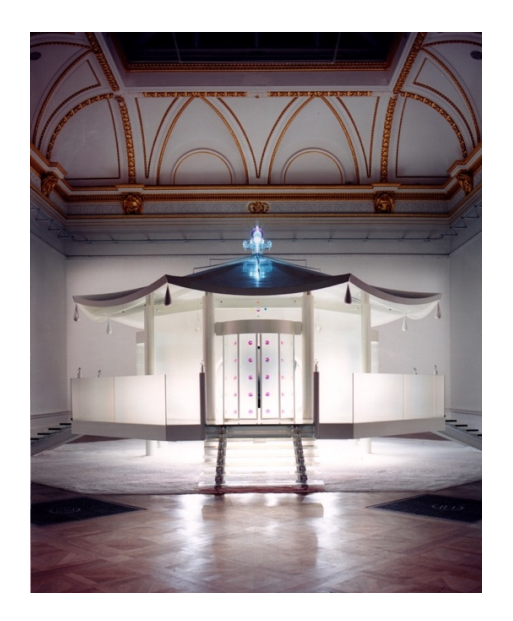
Figure 16. Mariko Mori, Dream Temple. 1999. Mixed media.