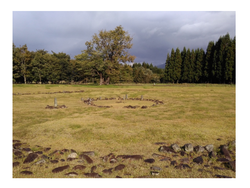
Figure 20. Ōyu stone circles, Kazuno, Akita Prefecture. Late Jōmon. Image reproduced under CC BY-SA 4.0 license. Photo G41rn8, Creative Commons.