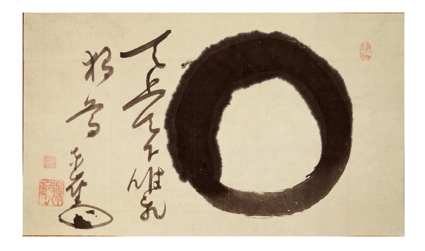
Figure 25. Torei Enji, Enso. XVIII century. Hanging scroll, ink on paper. Gitter-Yelen Collection (collection ref. 1972.1)

and a calligraphic exercise, where a figurative element is often accompanied by a short text. Usually in the form of the hanging scrolls, these paintings were meant to evoke a concept of the Zen Buddhist tradition and to support the practitioner through meditation (Mason 2005: 325). Excellent examples of the ensō paintings of this style can be found in works by the renowned master Hakuin Ekaku 白隠慧 鶴 (1686-1769) and the eminent Tõrei Enji 東嶺円慈 (1721-1792), who is believed to be his best disciple (Joskovich 2015: 321). Later works of Meiji period 明治時代 (1868-1912) reproducing this motif can be found in the practice of more recent artists such as Sekiren Ashizu 蘆津石蓮 (1850–1924).