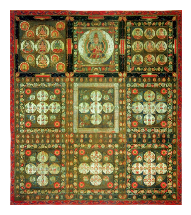
Figure 7. Unknown artist, Kongōkai mandala. Kyōogokokuji, Tōji, Kyoto. 2<sup>nd</sup> half of the IX century. Paint on silk.