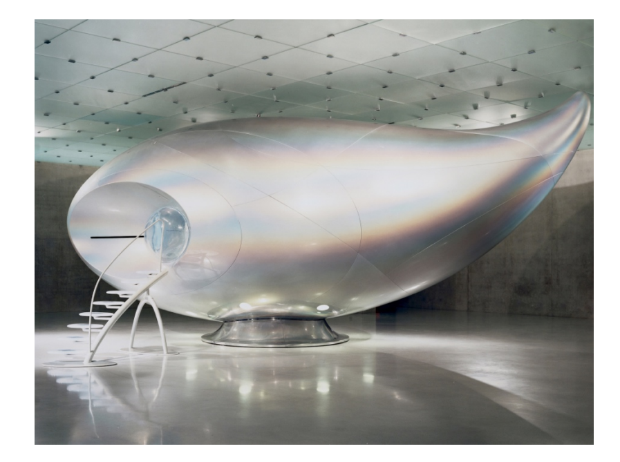
Figure 19. Mariko Mori, Wave UFO. 2003. Mixed media. Courtesy the Artist. Photo Richard Learoyd.

Oneness is composed by six identical sculptures representing blue anthropomorphic beings, approximately one meter tall, which stand on their feet and, facing outward, hold hands to form a circle. One might notice that these creatures look very similar to the attendants that surrounded the deity in Nirvana and Pure Land, but here they look more developed, and their purpose differs from the previous pieces: in Oneness , the visitors are encouraged to kneel and hug the sculptures, thus activating the installation. When hugged, the individual sculpture comes to life: its eyes light up and a mechanism turns on a heartbeat that can he heard by leaning on its chest. If they are all hugged together, the circular base of the installation illuminates, confirming a universal harmony between the participants. In a broader sense, the alien symbolizes the other, the unknown, and can be seen as our way to connect with the outside. In this way, Oneness can become a transcultural metaphor: Mori stated, 'I could be seen as an alien in another culture. Anyone living outside their own culture could be seen as an alien. We are different as individuals, but we are the same human beings' (Hayward 2007: sec. Oneness , para. 1).