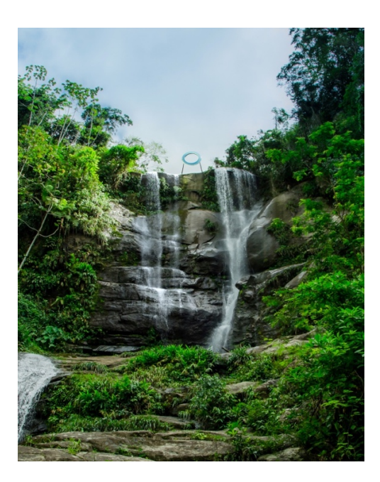
Figure 24. Mariko Mori, Ring (One with Nature). 2016. Courtesy the Artist.

Figure 23. Mariko Mori, Primal Rhythm – Sun Pillar. 2011. Courtesy the Artist. Photo Richard Learoyd.