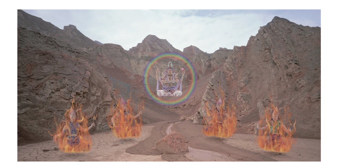
Figure 10. Mariko Mori, Burning Desire. 1996-98. Glass with photographic interlayer. Courtesy the Artist.