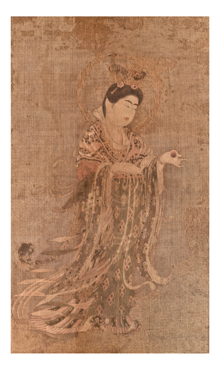
Figure 12. Unknown artist, Portrait of Kichijōten. Yakushiji, Nara. 771-772. Paint on hemp.