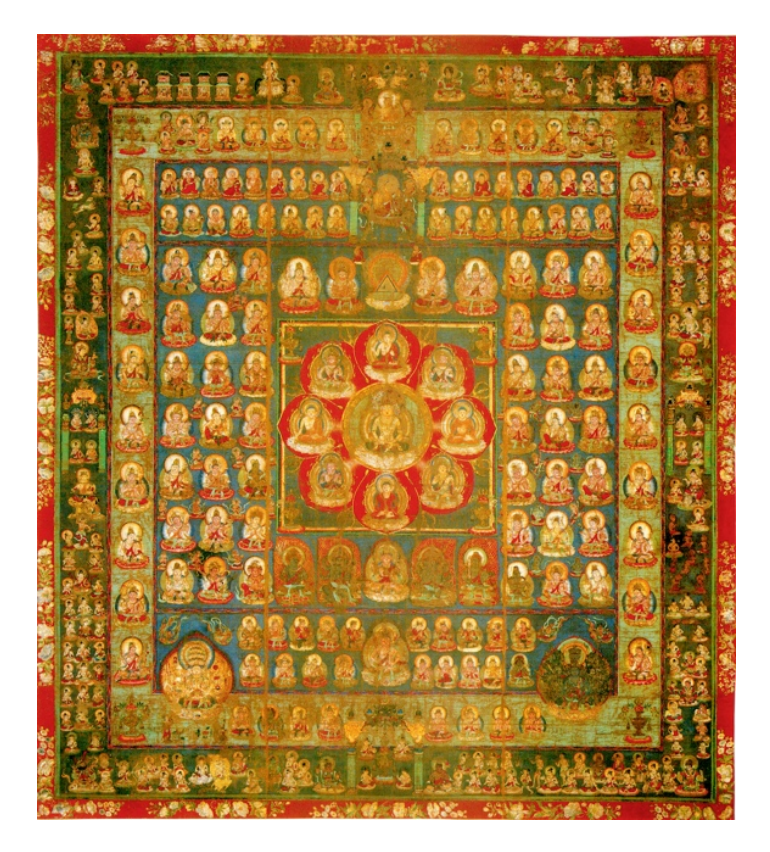
Figure 8. Unknown artist, Taizōkai mandala. Kyōogokokuji, Tōji, Kyoto. 2<sup>nd</sup> half of the IX century. Paint on silk.