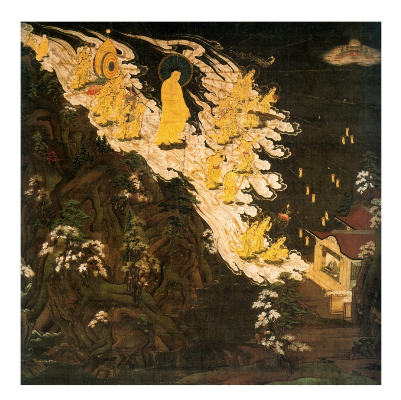
Figure 14. Unknown artist, Descent of Amida and Twenty-five Attendants (Haya raigō) . Chionin, Kyoto. 13rd century. Gold and paint on silk.