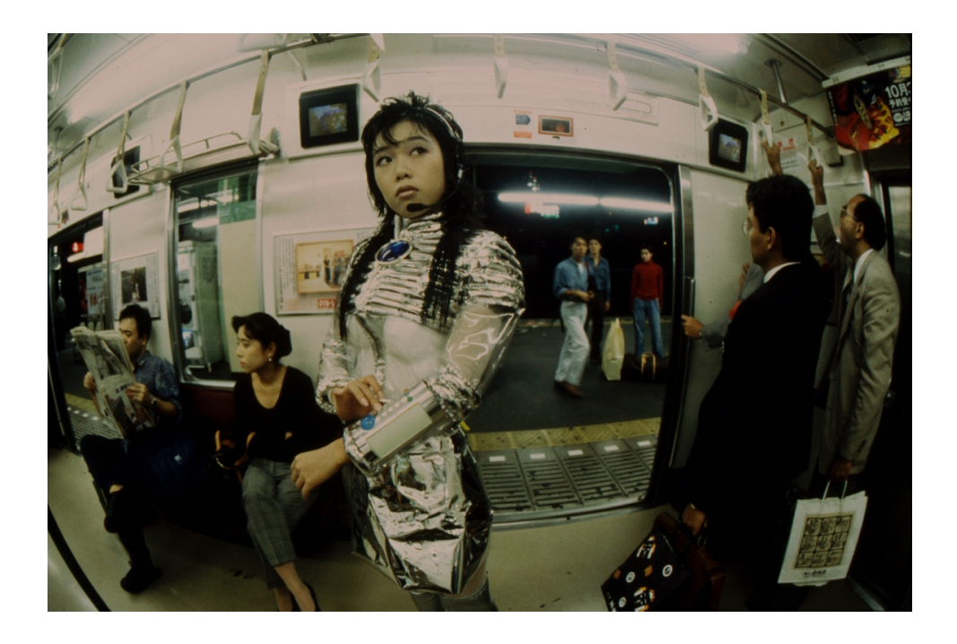
Figure 1. Mariko Mori, Tea Ceremony I. 1994. Cibachrome print. Courtesy the Artist.