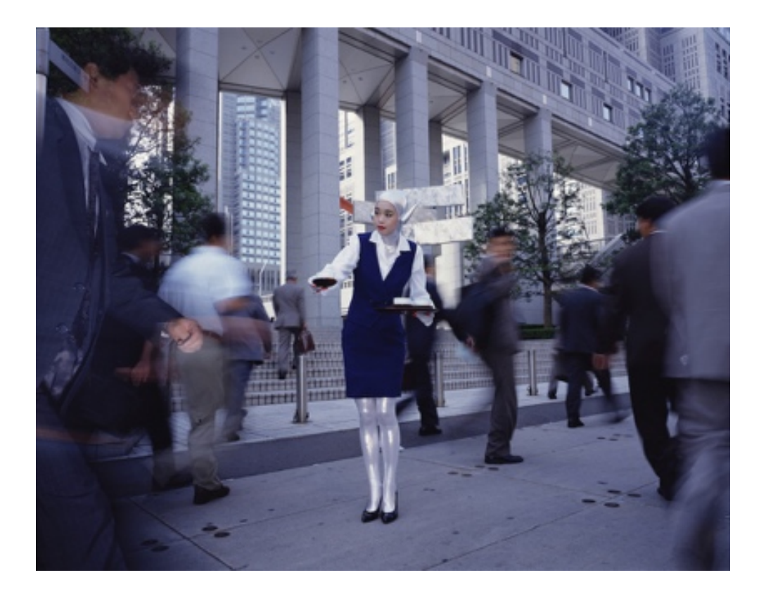
Figure 2. Mariko Mori, Subway. 1994. Fuji super gloss print.