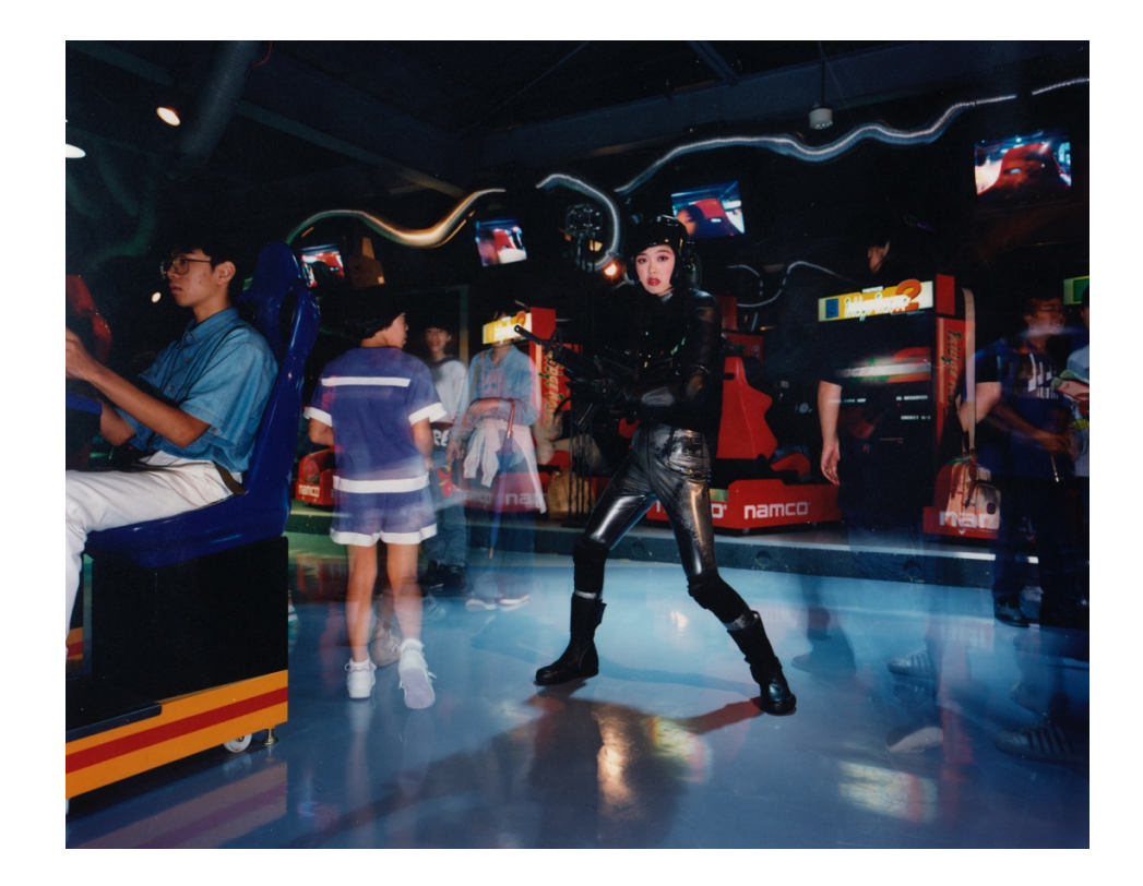
Figure 3. Mariko Mori, Warrior. 1994. Fuji super gloss print. Courtesy the Artist.