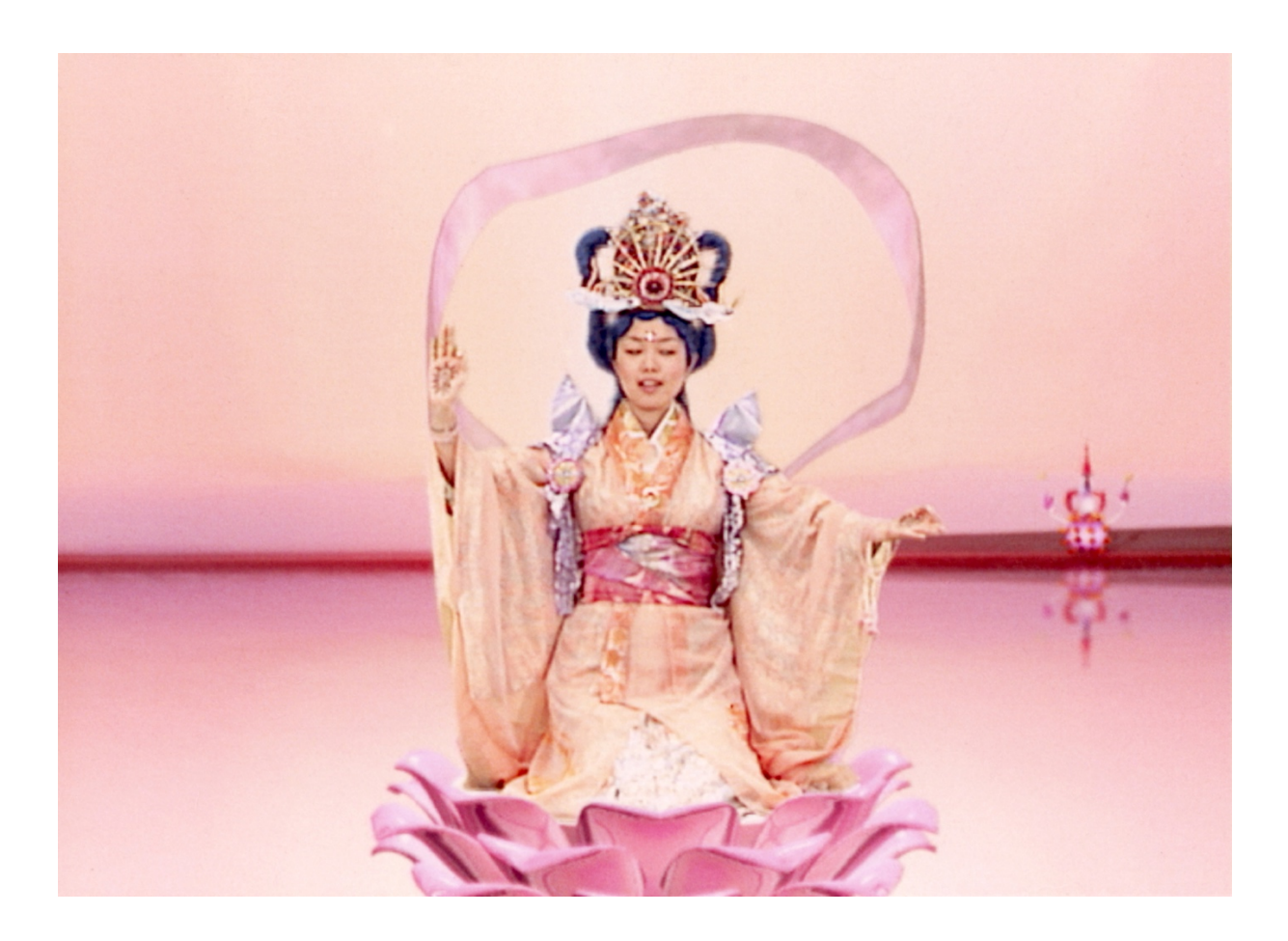
Figure 6. Mariko Mori, Nirvana . 1996-97. Still from video.

The nirvana depicted by the artist is a completely natural landscape, where a large body of water extends as far as the eye can see. All elements in the image are dominated by pink, yellow and orange nuances, even the sea and the sky that occupy the entire scene. At the center, an event takes place: a figure – Mori – is born from Earth and performs a ritual, standing on a lotus flower, and at some point she is surrounded by alien beings of different colors and vaguely anthropomorphic features. Many references to the Buddhist iconography are included in the piece, as a result of Mori's research conducted on the topic. She stated,