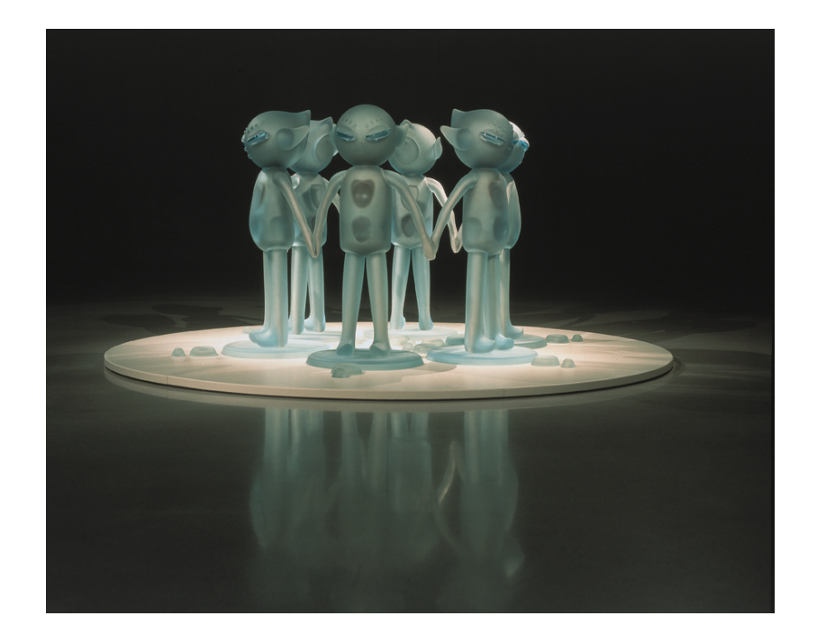
Figure 18. Mariko Mori, Oneness. 2003. Mixed media.

In the years following Dream Temple , Mori focused mainly on perfecting interactive art installations, conceived as collectively shared experiences. In these, the spectators become the key not only to experience, but also to activate the artwork. The pieces, in order to fully work as intended, need human interaction. Two of the main projects from after the turn of the century, Oneness and Wave UFO (both 2003), are the best examples of this new trend in Mori's art. The former was initially created as an introductory step for the latter; but, as it developed, it became a piece on its own.