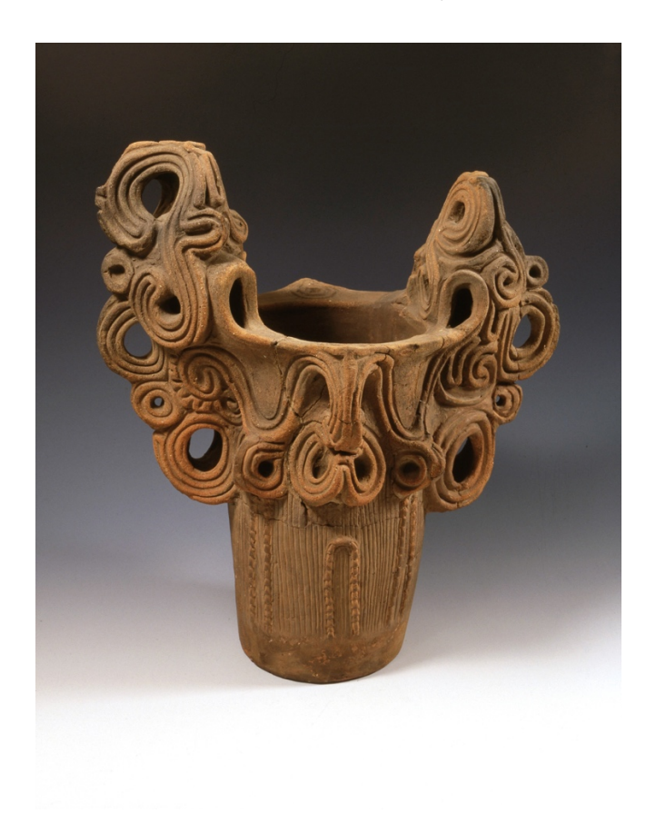
Figure 22. Unknown artist, Large, swirling water-flame patterned pot. Middle Jōmon. Earthenware.