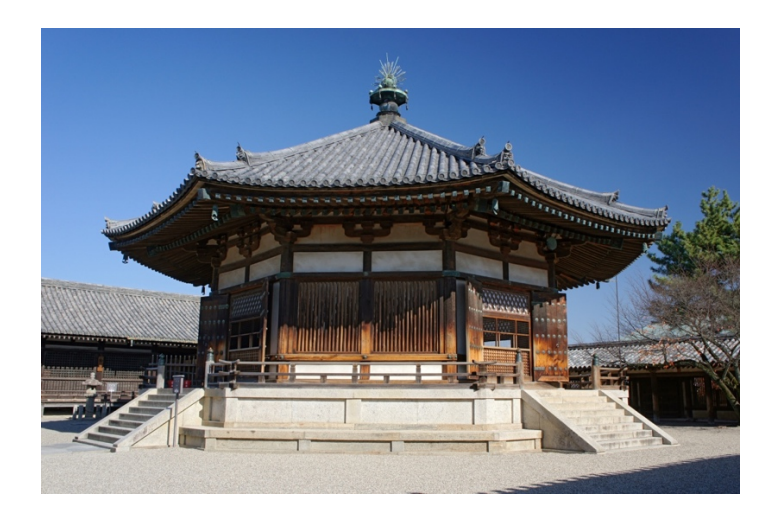
Figure 17. Yumedono, Hōryūji, Nara. VIII century. Image reproduced under CC BY 2.5 license. Photo 663 highland, Creative Commons.

Figure 16. Mariko Mori, Dream Temple. 1999. Mixed media. Courtesy the Artist. Photo Richard Learoyd.