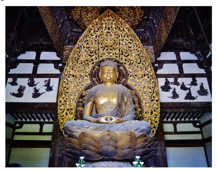
Figure 13. Jōchō, Statue of Amida Nyōrai. Hōōdō (Phoenix Hall), Byōdōin, Kyoto. ca. 1053. Wood, fabric, lacquer, gold leaf. Image reproduced under CC BY-SA 4.0 license. Photo Zairon, Creative Commons.

Mori's Pure Land ultimately represents the heavenly location seen through the artist's eyes. An additional source of inspiration for the piece can be found in what is traditionally conceived as the central location for Amida Buddha's worship – the Byōdōin 平等院 temple, near Kyoto, and in particular its hōōdō 鳳凰堂 ('Phoenix Hall').<sup>1</sup> Considered to be Amida's earthly residence, the building was enriched by decorations of bodhisattvas flying on clouds, with musical instruments, and is dominated by the formidable sculpture realized in 1053 AD by distinguished master Jōchō 定朝 (b. n/a – d.1057 AD), portraying a serene Amida sitting on a lotus flower, at the center of a luxuriously decorated aura with elaborate details. Jōchō's Amida Nyōrai is one of the highest manifestations of the style that developed in different areas of the country until the Kamakura period, and set a canon of sculptural proportions that remained unaltered for centuries (Vesco 2021: 372). The multiplicity of characters in the decorations of this room connects the Hall and its Amida sculpture to another concept of Pure Land Buddhism, which I would suggest as a further element to better understand the piece by Mori; the raigō 来迎 ('welcoming descent').