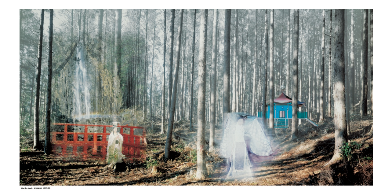
Figure 15. Mariko Mori, Kumano. 1997-98. Color photograph and glass.

The temple that appears in Kumano (both video and photo) is a crucial element in the artist's work, as this is the first apparition of what will be developed in a full-scale installation by Mori in the following years, called Dream Temple . The octagonal floorplan of the building and the shape of the roof recall the Yumedono hall 夢殿 ('Hall of dreams') in the Hōryūji Tōin 法隆寺東院 (the East Pavilion of the Hōryūji temple) in Nara. The building significantly impressed Mori, who stated, 'In a powerful dream I had on the night I walked to Kumano, a temple appeared. [...] Later, when I visited the Yumedono temple, [...] I felt it was the temple in my dream' (Hayward 2007: sec. Garden of Purification , para. 4). We can consider the video as an anticipation of a new turn in Mori's work: with an increasingly solid technological support, her pieces will gradually shift from two-dimensional photographs and videos to sculptures and large-scale, immersive installations.