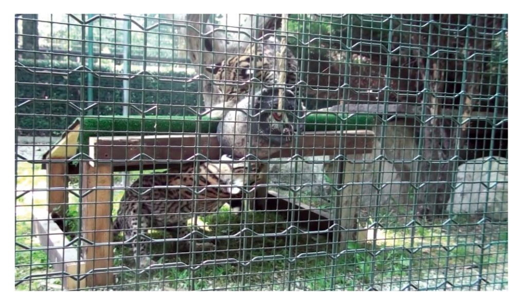
Figure 2. The platform used in E2 in the present study in the Ocelots' enclosure, one of the barrels is also visible.