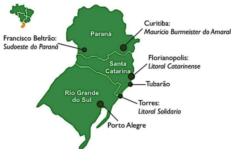
Figure 3. Cities and nuclei of the Rede Ecovida de Agrecologia considered in the survey.

The data used in this study are drawn from responses to a survey instrument administered between January and March 2011 in three nuclei of the Rede: Litoral Solidário, Litoral Catarinense, and Sudoeste do Paraná. Four nuclei of the Rede operate in the areas of analysis (see Figure 3).