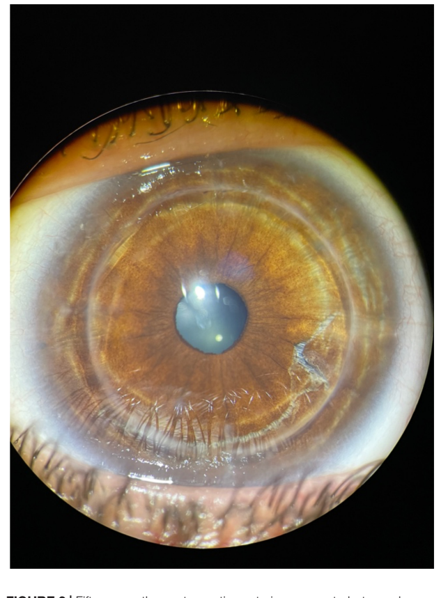
FIGURE 3 | Fifteen months postoperative anterior segment photography.

When ICRS implantation is performed, patients should be duly monitored with long-term follow-up due to risk of late complications. Ring extrusion represents one of the most