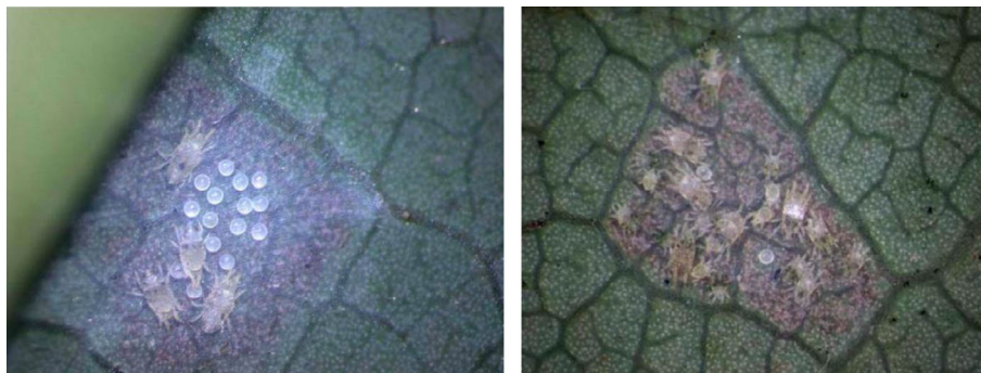
Figure 1: Oligonychus perseae nests on the underside of avocado leaves. Left: new nest containing eggs and adults. Right: old nest containing all life stages and showing the necrotic leaf tissue underneath. The body width and length of females (the larger specimens in the photo) are 0.17 × 0.32 mm.