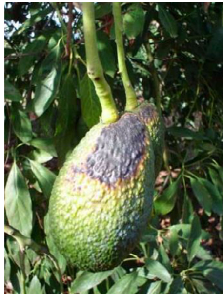
Figure 3: Sunburnt avocado fruit subsequent to severe defoliation caused by O. perseae