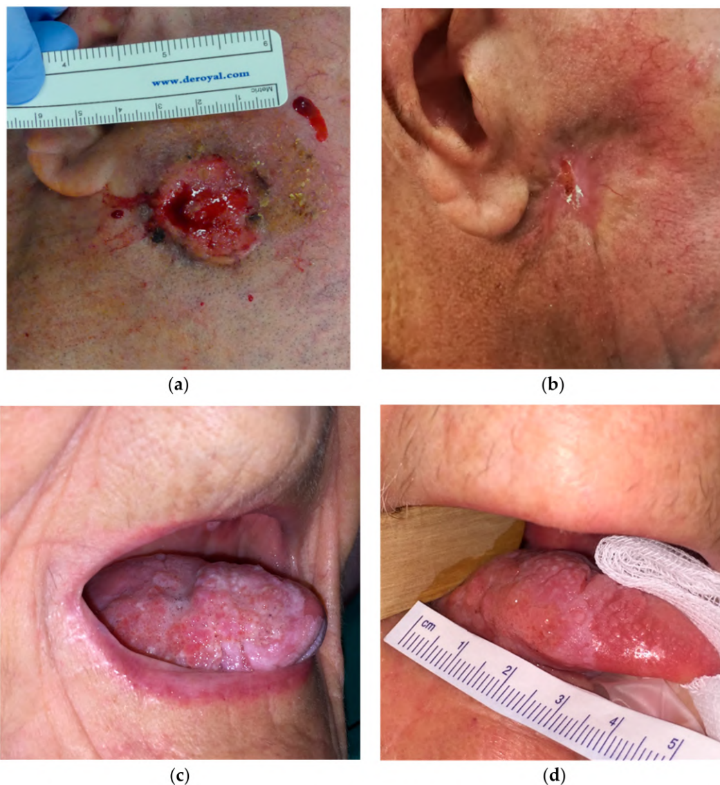
Figure 1. Pre- and post-operative lesions in two patients: (a) T2N0M0 squamous cell carcinoma of preauricular skin at T0; (b) partial response of preauricular skin cancer at T3 with bleeding control; (c) rT3N0 squamous cell carcinoma of the tongue at T0; (d) partial response of tongue cancer at T3.