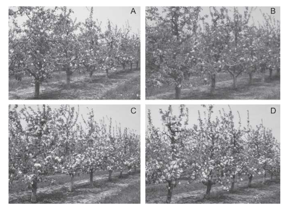
Fig. 1. Photographs of Redchief 'Delicious' trees (in a single replication, six trees per treatment) in the second "off year" after ethephon treatment (200 mg·L<sup>-1</sup>) in the 2 consecutive previous "on years" (1998, 2000); (A) nontreated control; ethephon applied, (B) 3, (C) 3 + 6, and (D) 3 + 6 + 9 weeks after full bloom. Mean bloom rating for A, B, C, and D was 4.1, 3.6, 6.9, and 7.1, respectively.

Means within a year followed by the same letter are not significantly different at P = 0.05 by Tukey's HSD test.