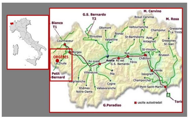
Fig. 1. Location of the archaeological excavation of Orgères

archaeozoological analyses. As a matter of fact the isotopic analyses of teeth of newborn sheep and goats found in the stable, concrete archaeological evidence, have demonstrated that the animals were not subject to transhumance since the percentage of oxygen, nitrogen and strontium registered is constant [3-4]. A document dated 1305 which mentions an important market in Morgex, where the products of the mountain valleys were most likely sold, testifies that the economy of the valley provided for the control of the management of the meadows, breeding and production of milk and derivatives. Even the various areas of forging and processing testify to a self-sufficient economy and support for those who had to cross the Alps to reach Tarantasia and the market areas of northern Europe: a significant datum, in this regard, is the significant quantity of nails ice for shoeing animals [5]. In this work, these considerations related to daily life have been enriched by bio-molecular analyses carried out in order to characterize soil microbial communities and/or plant traces potentially informative on the past human activities in the site.