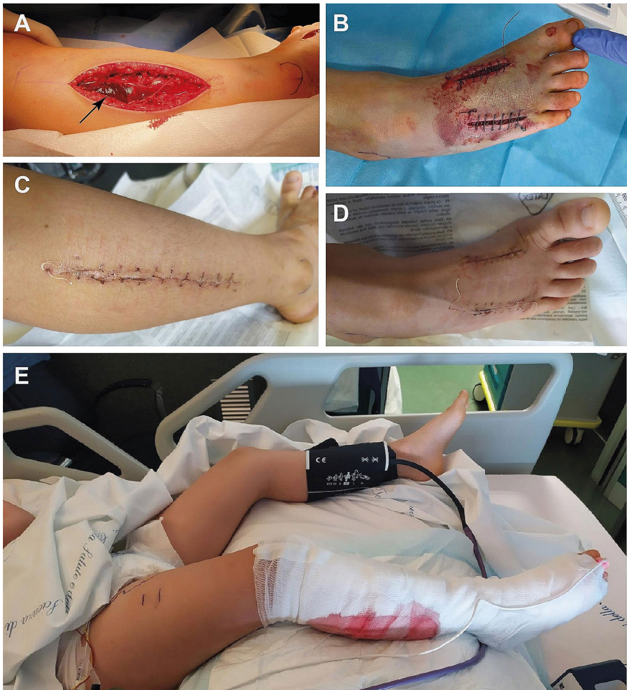
Fig. 2 (A) Fasciotomy of the leg lateral compartment. Notice the dark color of muscles (arrow), suggestive of initial ischemic damage. (B) Fasciotomy of the foot dorsum. (C, D) Definitive skin closure after 18 days. (E) Photograph taken after extubation. Notice the presence of massive edema in the right limb

exam was performed due to the presence of a painful fibrotic cord on the medial aspect of the right thigh, with no evidence of thrombotic phenomena. Starting on June 13, the girl developed an intensely itchy, erythematous papular rash covering the entire body, compatible with drug-induced toxidermia (Fig. 3). After dermatological