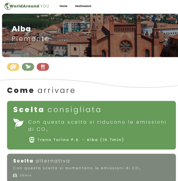
Figure 4: Suggested transportation mean to the selected place.

the user. In other words, it is not only a matter of suggesting the best places to visit but also convincing the user to organize eco-friendly tours. Helping this organization, and informing people about the impact of their travel choices, is a first step in this direction. Moreover, in the future, we plan to involve multiple stakeholders, such as policy makers and tourist agents to improve the functionalities of the app.