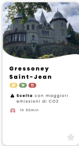
Figure 2: Other places that could be visited but represent less sustainable options.

prominent in the user interface. Moreover, it explains that this solution reduces CO 2 emissions ("Con questa scelta si riducono...").