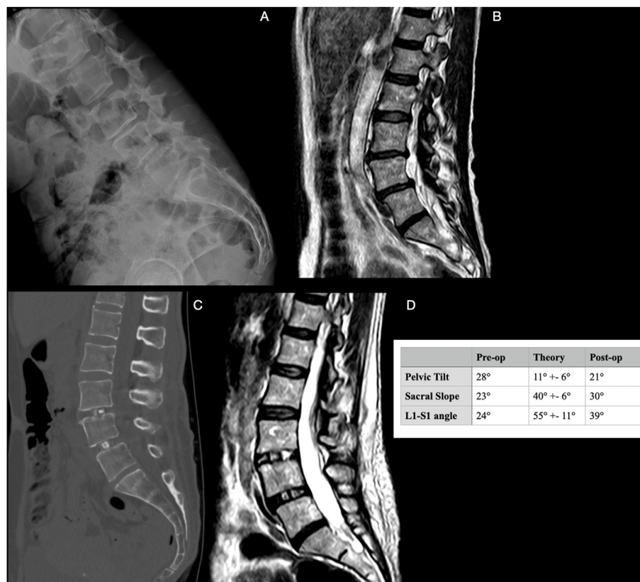
Fig. 3. We report the clinical case of a 57-year-old woman with chronic low back pain and degenerative discopathy with L4-L5 listhesis (standing Rx A, and pre-operative MRI, B) who benefited from a significant improvement in sagittal balance parameters after stabilization surgery with double MS-TLIF L3-L4-L5 with lordotic cages (CT scan after 1 month, C and MRI control after 6 months).