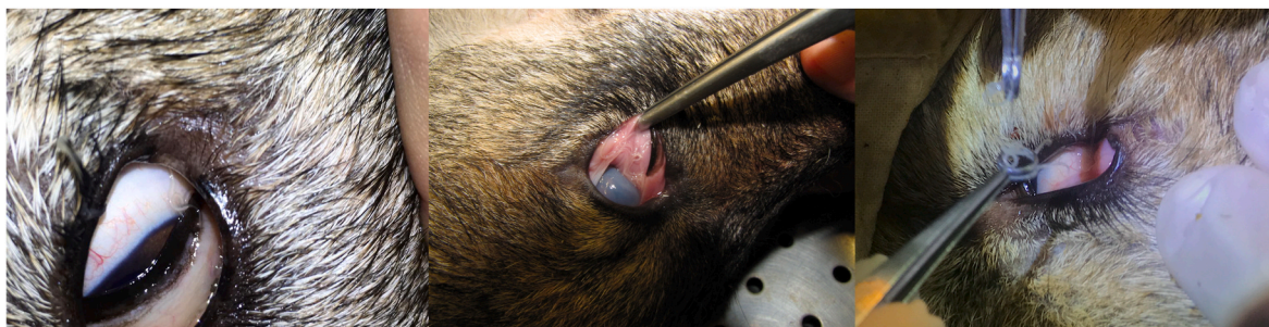
Fig. 1. Presence of Thelazia callipaeda in the conjunctival sacs of wolves ( Canis lupus ) from the Italian Alps.