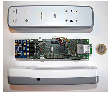
Fig. 3. The Figure shows the EasyReach remote control, its keyboard and enclosure and its internal electronics

Therefore, it has storage, processing power and main memory capabilities in the ballpark of an average personal computer. In order to provide the main Social Interaction front-end, the set-top-box is directly connected with the user's TV-set (normally through a HDMI cable). Moreover, it provides Wi-Fi connectivity and it has a programmable infrared device used for controlling the TV-set basic functions (e.g., channel switching and volume management).