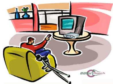
Fig. 1. Using EasyReach at home

This paper describes the project goals and the mid-term prototype that has been demonstrated live at the Ambient Assisted Living (AAL) Forum in Eindhoven in September 2012, receiving the attention of diversified stakeholder representatives. The paper presents first the architecture of the system (Section 2), then proceeds to describing its three main building blocks: the Hardware (remote control and set-top-box) will be presented in Section 3, the Social Interaction Environment will be presented in Section 4, while the Personal Assistant will be presented in Section 5. Finally, Section 6 describes the current evaluation steps according to a user driven methodology, while some conclusions end the paper.