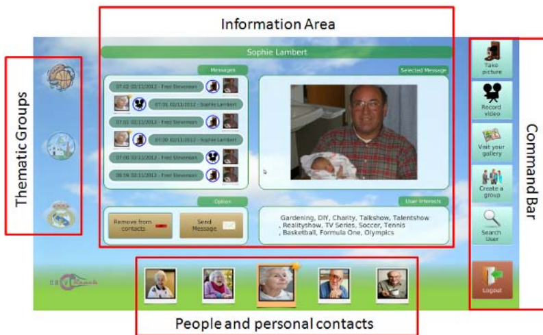
Fig. 4. The Social Environment

The EasyReach Social Interaction Environment aims at providing the elderly and pre-digital divide people with a simple and clean environment to interact with, where the information is easy-to-find and presented in a structured way. The interfaces of today’s digital devices are often too complicated and dispersive for non accustomed people (e.g., the social applications on the smartphones, designed for small displays, and with a lot of “crowded” icons, or even the ordinary web pages, often very distracting due to their unstructured nature and the huge quantity of information displayed). A sketchy view of the EasyReach front-end is shown in Figure 4, while its SW integration within the overall system architecture is shown in Figure 2, as part of the EasyReach Client component.