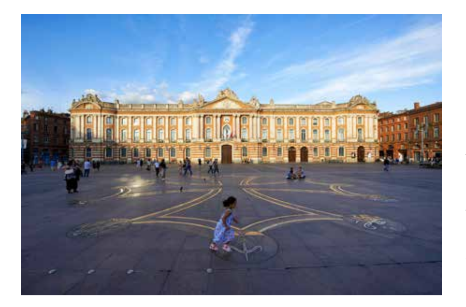
After seeing the Place du Capitole, the basilica of Saint-Sernin and the Jacobins church, from the banks of the River Garonne you can admire the splendid views of the most iconic monuments of Toulouse.