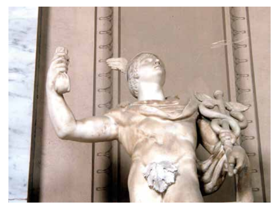
Figure 2. Statue of Mercury in the Vatican with the fig leaf placed over his privates under. Creative Commons license.

4. Re-writing : It is when what is represented in monuments is turned into something different. In 2015 in Forlì, the building previously used as the headquarters for the Fascist youth organization was turned into an exhibition centre devoted to the study of totalitarian architecture in South-Eastern Europe (Fig. 3). This restoration reframed the meaning of the Fascist building in today's Italy (Nanni and Bellentani 2018: 405-406).