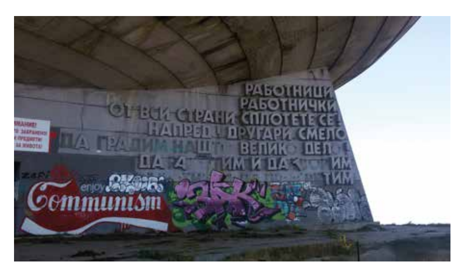
Figure 7. The Buzludzha monument in Bulgaria built in the place where in 1891 a group of socialists assembled secretly to form a forerunner organisation of the Bulgarian Communist Party. Creative Commons license.

3. Maquillage: Probably the most used playful strategy against controversial monuments, maquillage involves some minor additions capable of resemantising the monument. Splashing of blood-red paint the statue of Indro Montanelli in Milan (Fig. 4), for example, is a simple form of maquillage possibly involving some pretend play. The Buzludzha monument in Bulgaria, a futurist architecture built during the communist regime to commemorate the Bulgarian Communist Party, has often attracted graffiti artists and amateurs: quite popular is a graffiti representing the word "Communism" drawn as the Coca Cola logo (Fig. 7). The monuments, in these cases, are used as support for new writings that can alter slightly but significantly the original meaning and unwillingly offer a space for dissent. Light projections have also often been used in a creative way to reshape the meaning of monuments. While light shows have mostly a merely aesthetic purpose, others have a clear political dimension, such as the writings projected on Palazzo Chigi (the official residence of the Prime Minister of Italy) in January 2021 by youth associations asking to be heard by the government. In some cases, this approach has already targeted also controversial monuments: during the Black Lives Matter protests in