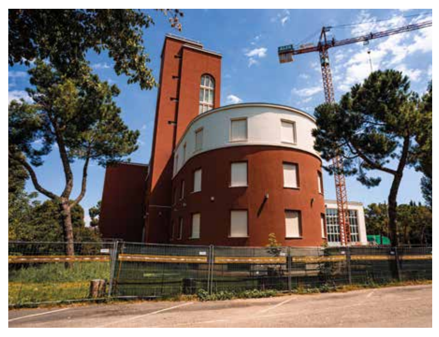
Figure 3. The headquarters of Opera Nazionale Balilla (ONB) under restoration in August 2014.

5. Erasing: It is the most basic way of dealing with unwanted cultural heritage. In 2020, during the Black Lives Matter protests, there has been an acceleration of this iconoclastic tendency: several monuments were removed or plans for removal were announced. Removals focused, in a first time, on monuments related to leaders of the Confederate States of America, but they soon expanded to other monuments considered to celebrate slavery and racism. Statues of Columbus were removed across the US, monuments to King Leopold II were removed in Belgium and Colston's statue in Bristol, after being retrieved from the bay, was moved to a museum. In Italy, a controversy emerged about whether to remove or not the statue of Indro Montanelli, an Italian journalist that came under scrutiny for his fascist and colonialist youth (Fig. 4). Removal of monuments can also highlight a regime change: for example, after the collapse of the Soviet Union, crowds toppled and knocked down monuments representing Soviet leaders.