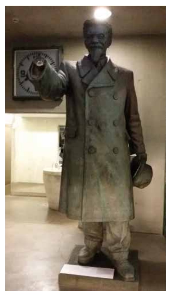
Figure 1. A Soviet statue guarding the toilet of the Museum of Occupation in Tallinn until 2019.

3. Maquillage: It can also change the original meanings of monuments. For example, Roman statues' genitalia were sometimes removed or hidden in the Middle Ages, since they were considered offending the public decency (Fig. 2). Similarly, during the French Revolution statues that were deemed to represent the Ancien were decapitated.