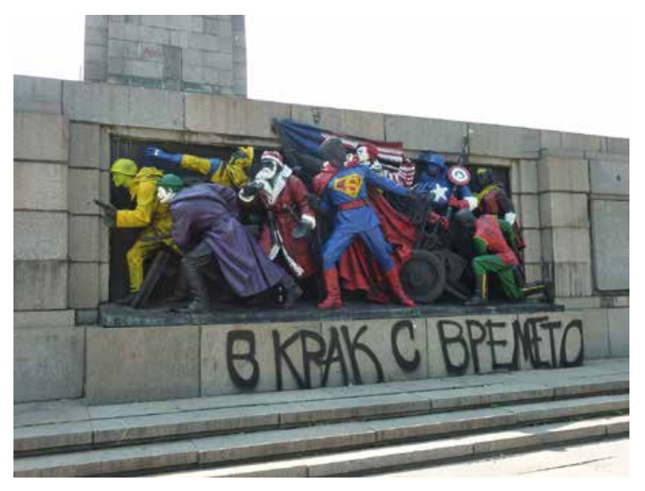
Figure 8. In February 2014, the 1950s Monument to the Soviet Army in Sofia was daubed painted and the represented soldiers transformed into pop culture icons.

reach for bottom-up approaches. Moreover, while we can imagine a playful context in the destruction of a monument, that would not leave traces behind it, and the playful potential of the action would be exhausted immediately.