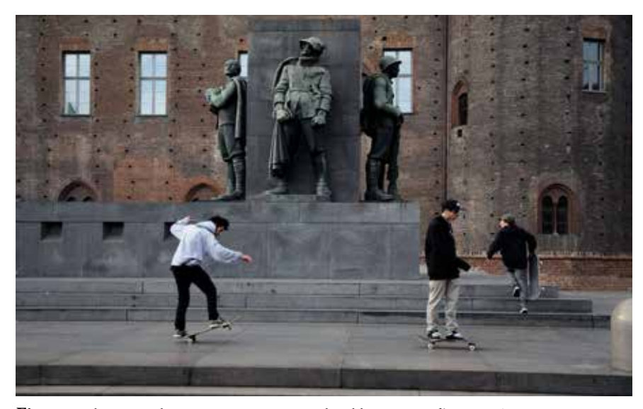
Figure 5. Skaters on the Monument to Emanuele Filiberto Duca d'Aosta in Turin.

& Heljakka 2019) statues by, for example, providing them with toilet paper during the first wave of Covid-19 in 2020, is a way to devoid the monument of meaning and, instead, to use it as support for a joke. While there have not been many recorded examples of this behaviour towards controversial monuments, making fun of them and involving them in playful practices as the ones described could be an effective way of challenging and maybe defusing their original meaning.