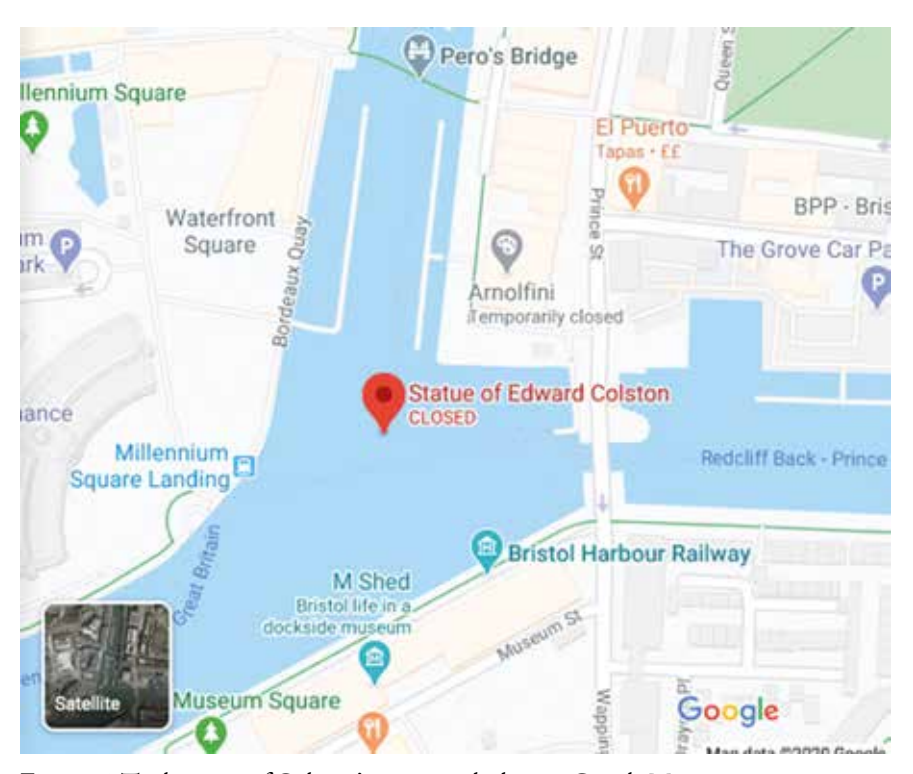
Figure 6. The location of Colston's statue in the bay on Google Maps.

play with the citizens' perception of the spaces. A similar approach has been taken by positioning Kristen Visbal's statue of the "Fearless Girl" right in front of the Charging Bull of New York's financial district. The move was interpreted by many as giving a negative connotation to the bull and, therefore, to the Wall Street ideology altogether. Adding new monuments, or different plaques to modify the context around controversial monuments, therefore, can be an effective way to propose a counter-narrative to that embodied by the monuments themselves. Finally, the many digital maps that exist online can also work as the context of a monument – and have been in some cases used in a playful way. It is the case of Google Maps, which, for some time, has changed the location of Colston's statue in the bay in which it was thrown by the protestors (Fig. 6). Playful approaches to controversial monuments, then, can also engage the vast hypertextual net that surrounds them online and use it to contrast the ideologies that they carry.