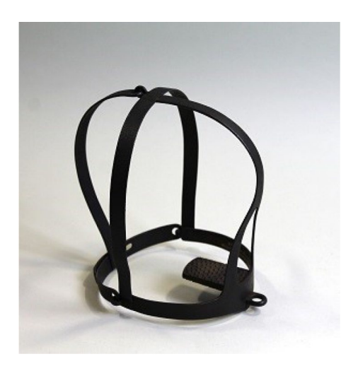
Fig. 3 Scold's bridle, Leeds Museum, 16th Century

about the facial space as an unstable space of meaning construction (see Figs. 1, 2, 3).