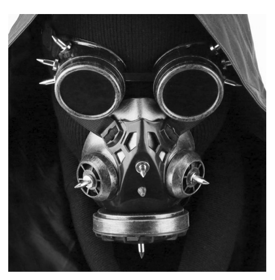
Fig. 7 Steampunk mask

The artifact started to be worn in the 80 s by hip-hop and rap artists mainly from the South of the United States such as Raheem the Dream and Kilo Ali (both from Georgia). From the cultural and geographical periphery of the United States, grillz became progressively popular among New York artists thanks to an immigrant of Surinamese descent, Eddie Plein,