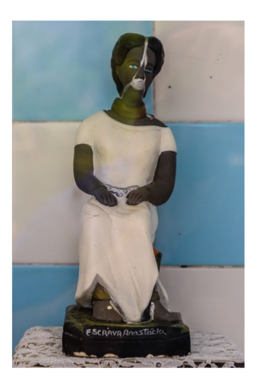
Fig. 4 A votive statue of Escrava Anastácia in the Church of the Third Order of Our Lady of the Rosary of the Black People , Salvador, Bahia, Brazil

The grill is an artifact form of dental jewelry, made of several types of materials, among them silver, gold, platinum or precious stones. Examined from the point of view of sign production (Eco 1975), a grill derives from a dental impression, which is a negative imprint of the teeth from which a positive reproduction has been formed. Therefore, the grill is isomorphic to its imprinter, i.e., the dentition or part of it, as it is configured as an imprint, a cast that is then manipulated with expressive substances different from those of the dentition, namely, the different materials of the plating. Unlike resin-based dental prostheses, which are also made from a cast of the teeth, but are to remain concealed and look real , grillz expand the teeth with different colors and textures (e.g., golden or even rainbow-colored grillz —as in