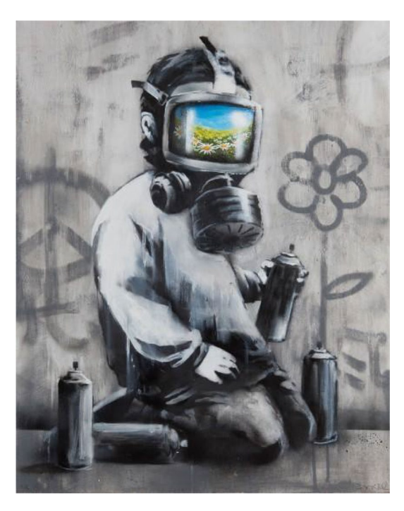
Fig. 6 Gas Mask Boy, Banksy, 2009

to the loss of the hypnotic primacy of the eyes and even the lips within the facial configuration. The inside of the mouth is thus magnified, and so are functions such as biting and chewing (whose organs are covered in flashy materials).