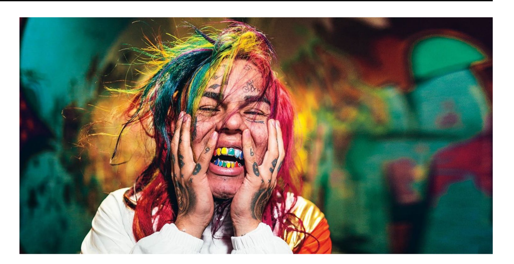
Fig. 1 Tekashi 6ix9ine 's rainbow mouth

wearability, the paper will focus on the strategies through which the accessorized face of the bearer expresses a dissent towards a correspondent form of established (re)productivity system: in turn, class, sexuality, order and production.