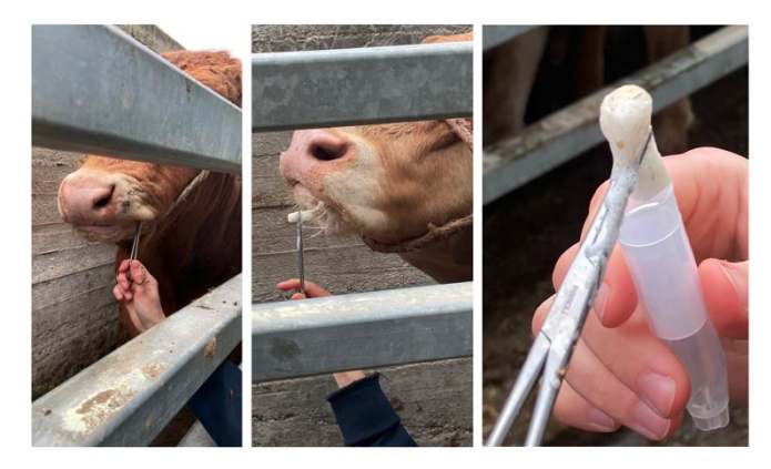
Figure 2. Bovine saliva collection.

saliva extract was subjected to LFIA (first phase) and to both EIA and LFIA determination (second phase) without any further treatments.