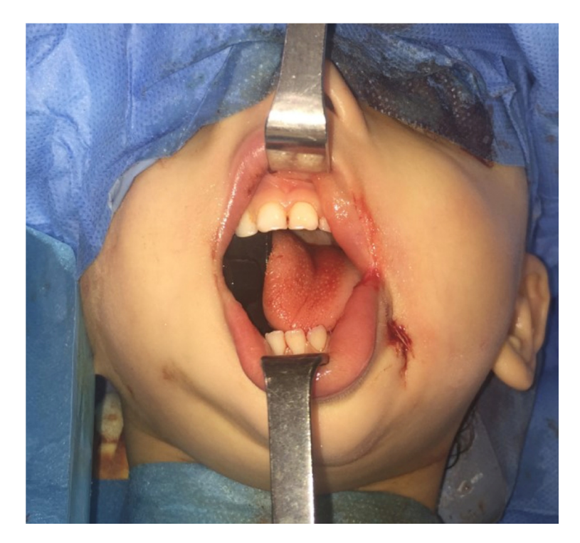
Figure 3. An intraoral buccal access has been performed. No submandibular or preauricular scars are visible. The vertical distractor has been placed.

From a surgical point of view, an intraoral buccal approach permitted access to the bony fusion (Figure 3). Intraoperatively, extra-articular ankylosis of the left TMJ was assessed. The osteotomy was taken by Mectron PIEZOSURGERY<sup>®</sup> and a KLS Martin<sup>®</sup> internal distractor was placed.