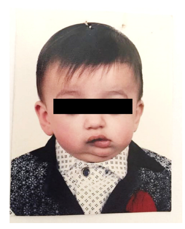
Figure 1. The frontal view of the baby showing the laterodeviation of mandible to the left.

Clinically, the child presented with left hemimandibular hypoplasia and low-set ears, whereas there were no other abnormal features including limbs (Figure 1).