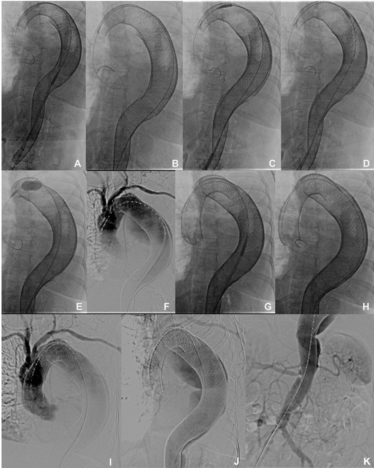
Fig 2. A, Fluoroscopic images of Cardiatris multilayer flow modulator (CMFM) deployment. B, Modules and the ballooning maneuver showed CMFMs shortening with loss of both central overlapping regions. C-D, A fourth CMFM was positioned and ballooned. Presence of an infolding in the proximal end point. E-H, After the proximal end point ballooning, the CMFM retracted and dislocated, so a fifth CMFM was deployed, covering the whole aortic arch and landing in the ascending aorta. I-K, Fluoroscopic images of final control after CMFMs' deployment.