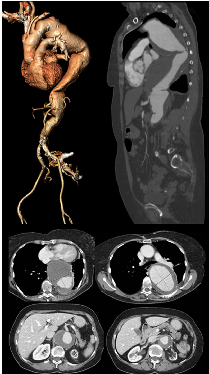
Fig 1. The computed tomography angiography (CTA) showed the maximum increased dilatation of 81 mm at vertebral T4-T6 and a dilatation of infrarenal abdominal aortic aneurysm of 60 mm. The size of the aortic arch at the common carotid artery was 32 mm, at the subclavian artery was 30 mm, and the length between the common carotid artery and the subclavian artery was 15 mm. The distal sealing zone, at the abdominal aortic artery, had a diameter of 26.5 mm and a length of sealing zone of 40 mm.