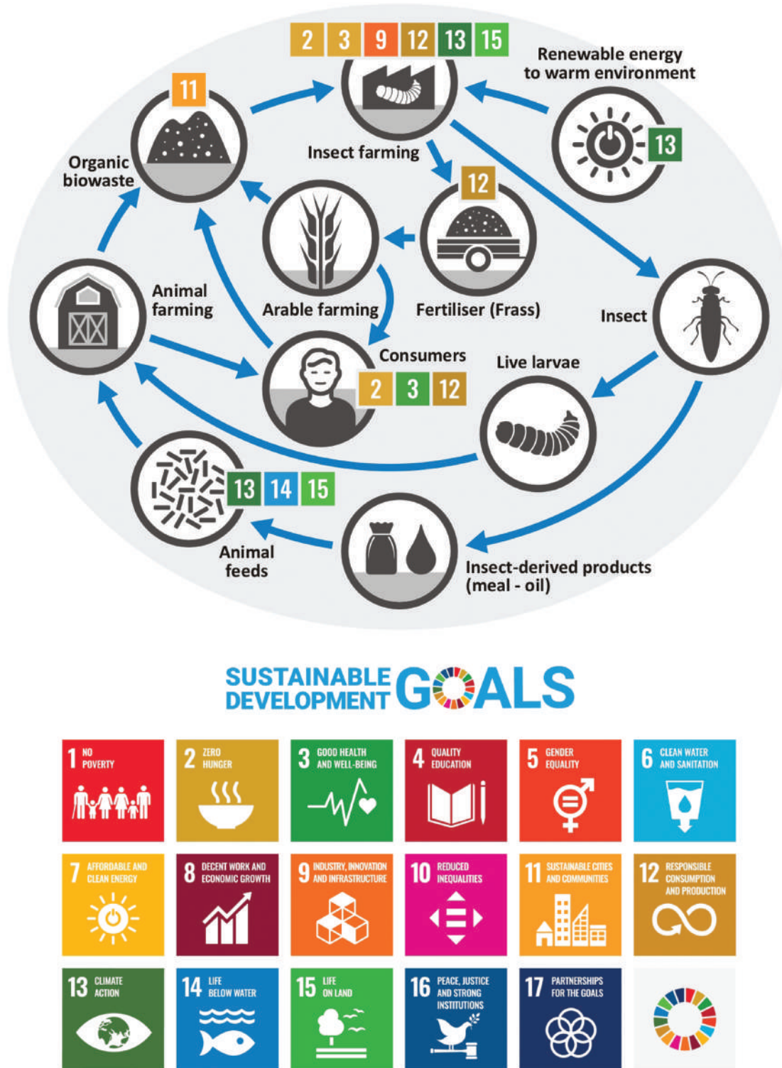
Figure 2. Circular Economy and Sustainable Development Goals related to insect farming.

Research performed using insects in shrimp nutrition is limited and recently reviewed by Sánchez-Muros et al. (2020). No differences in Litopenaeus vannamei performances are reported up to 30.5% of full-fat TM meal inclusion fully substituting FM as far as a correct balance of essential amino acids is ensured. In a non-balanced formula, a percentage including