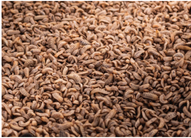
Figure 1. Black soldier fly ( Hermetia illucens ) larvae.

extent, the common housefly ( Musca domestica , MD) (van Huis, 2022).