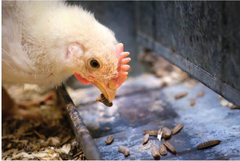
Figure 4. Poultry feeding live Hermetia illucens larvae.