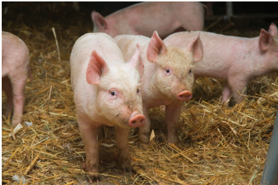
Figure 5. Live Hermetia illucens larvae can also be provided to piglets.