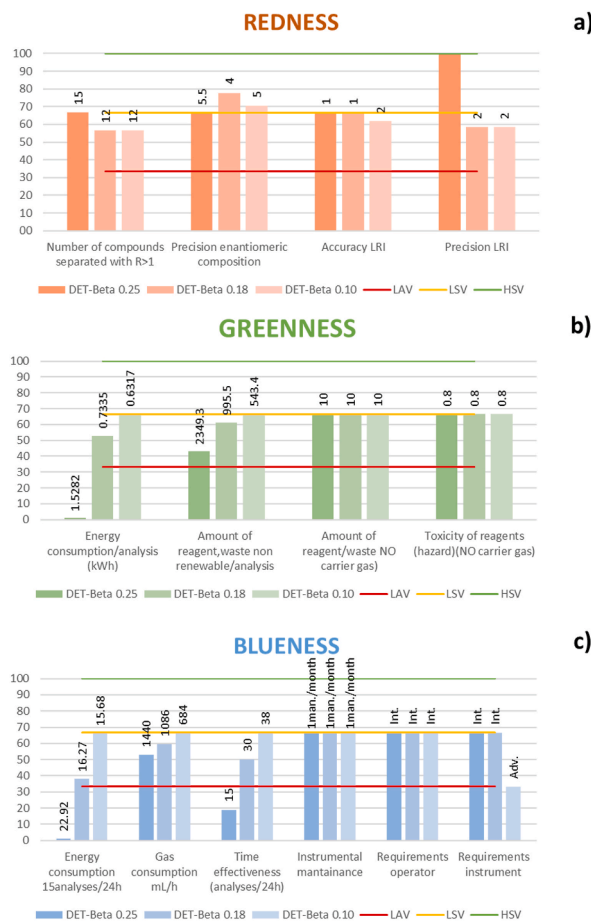
Fig. 4. Comparison of RGB scores obtained for each criterion in terms of redness (a), greenness (b) and blueness (c) for the investigated columns. Legend: LAV - Low Acceptable Value, LSV - Low Satisfactory Value, HSV - Highest Satisfactory Value, man./month - maintenance/month, int. - intermediate, adv. - advanced.

portant to emphasize that the DET-Beta 0.10 column reaches pressures up to 250.8 kPa, a pressure that not all GC systems can achieve (in particular those of the previous generations).