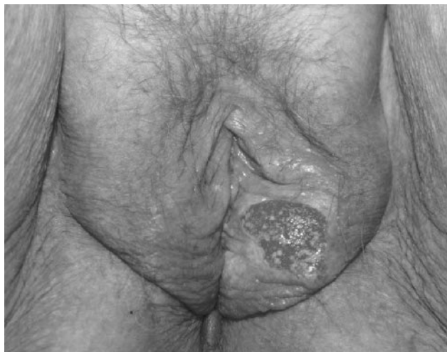
Figure 2. Clinical aspect of primary vulvar Paget disease with stromal invasion: ulcerated area on the left labium majus.