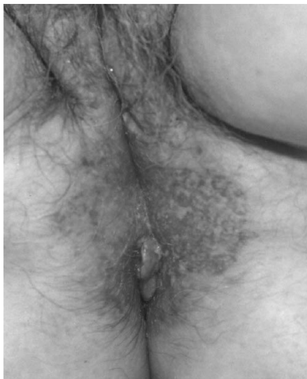
Figure 3. Clinical aspect of intraepithelial primary vulvar Paget disease: perineal and perianal extension of eczematous appearing lesion.

Vulvar Paget disease diagnosis is established through the histologic examination of a biopsy. Pathognomonic is the finding of atypical glandular type cells, the Paget cells, scattered or grouped in nests within the surface squamous epithelium [34, 35]. In routine hematoxylin and eosin stained histologic sections, Paget cells are rounded or polygonal elements of relatively large size with abundant clear pale eosinophilic cytoplasm (Figure